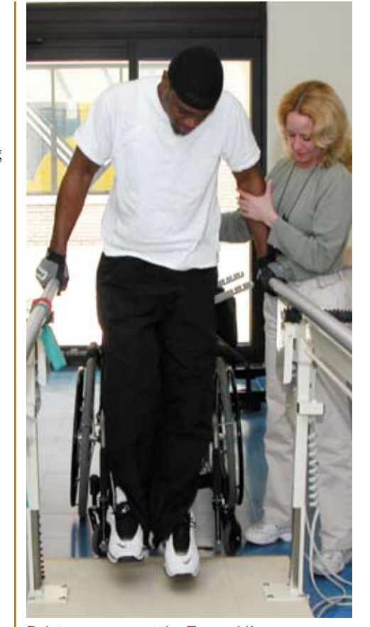
Polytrauma care at the Tampa VA.