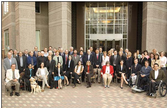
Members of the Telecommunications and Electronic and Information Technology Advisory Committee