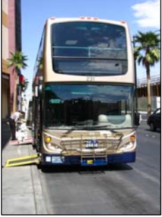
The Board examined access to double-decker buses and other modes of public transportation in Las Vegas.