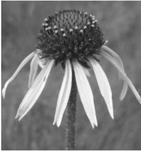
Prevention. Marketed as Echinacea , purple cone-flower is one species being targeted for conservation before it becomes scarce.

The U.S. market for medicinal herbs is worth more than $3 billion and is growing by about 20 percent per year. At least 175 species of plants native to North America are sold in the non-prescription medicinal market in the United States, and more than 140 native U.S. medicinal herbs have been documented in herbal products and medicines in foreign countries.