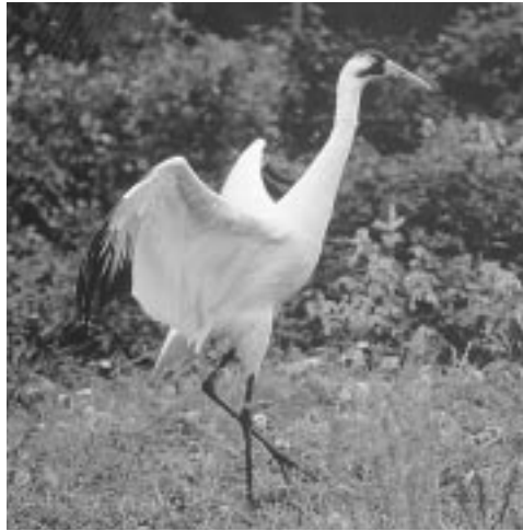
Coming along nicely. Captive bred whooping cranes—like this one at Patuxent NWR in Maryland—are part of a continuing successful effort to recover whooping cranes.

Another significant whooper group is the non-migratory flock in Florida, which currently consists of 91 birds. Since 1993, between 20 and 30 juvenile whooping cranes have been raised annually in captivity and soft-released onto the Kissimmee Prairie of central Florida. These birds are raised by handlers wearing crane costumes so that the birds remain afraid of people and learn the right behaviors to enable them to survive in the wild.