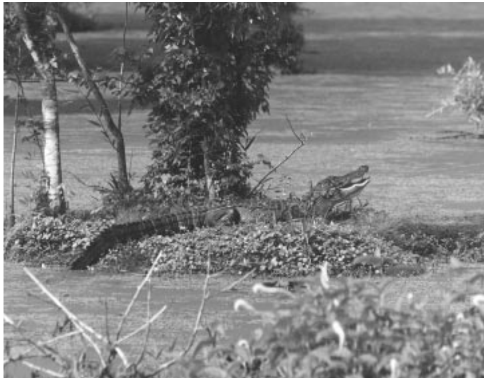
American alligator.