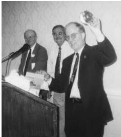
Fitting tribute. Parting is such sweet sorrow... unless you get a big party and neat gifts like this fishing reel.