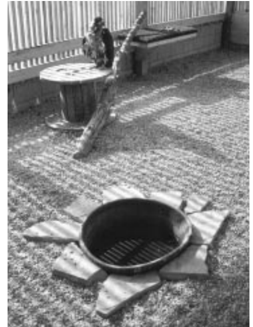
Home. A golden eagle caught in a sunbeam at the new Zuni Pueblo aviary.