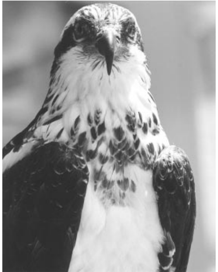
Osprey.