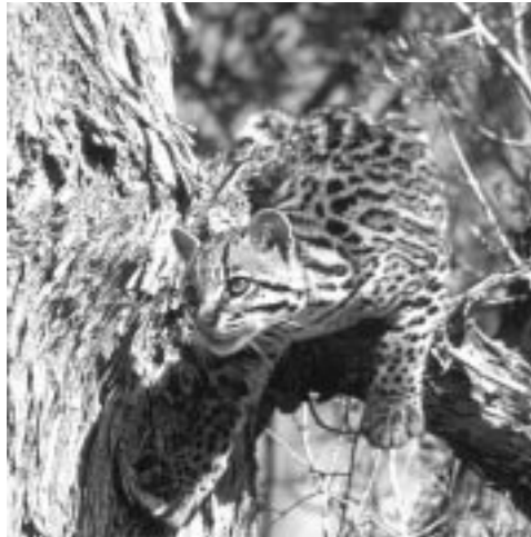
It's an "obsession." Biologists on the Texas Gulf Coast discovered that a men's fragrance attracts endangered ocelots.

Although the activities at these Texas refuges are varied, together they make up the efforts of a united goal: restoring the Texas Gulf Coast, a unique and vital ecosystem between the mouth of the Rio Grande and the Sabine River, a natural border between Texas and Louisiana.