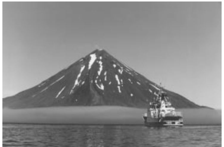
MV Tiglax at Chuginadak. Alaska