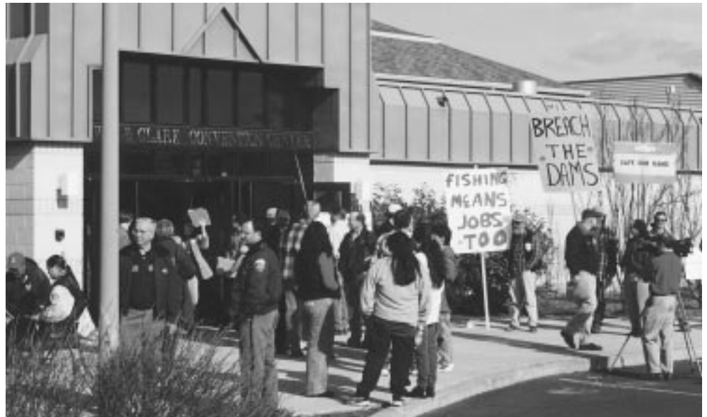
Expression. Protesters swirled around a public meeting in Clarkston, Washington, on recovering Northwest salmon.