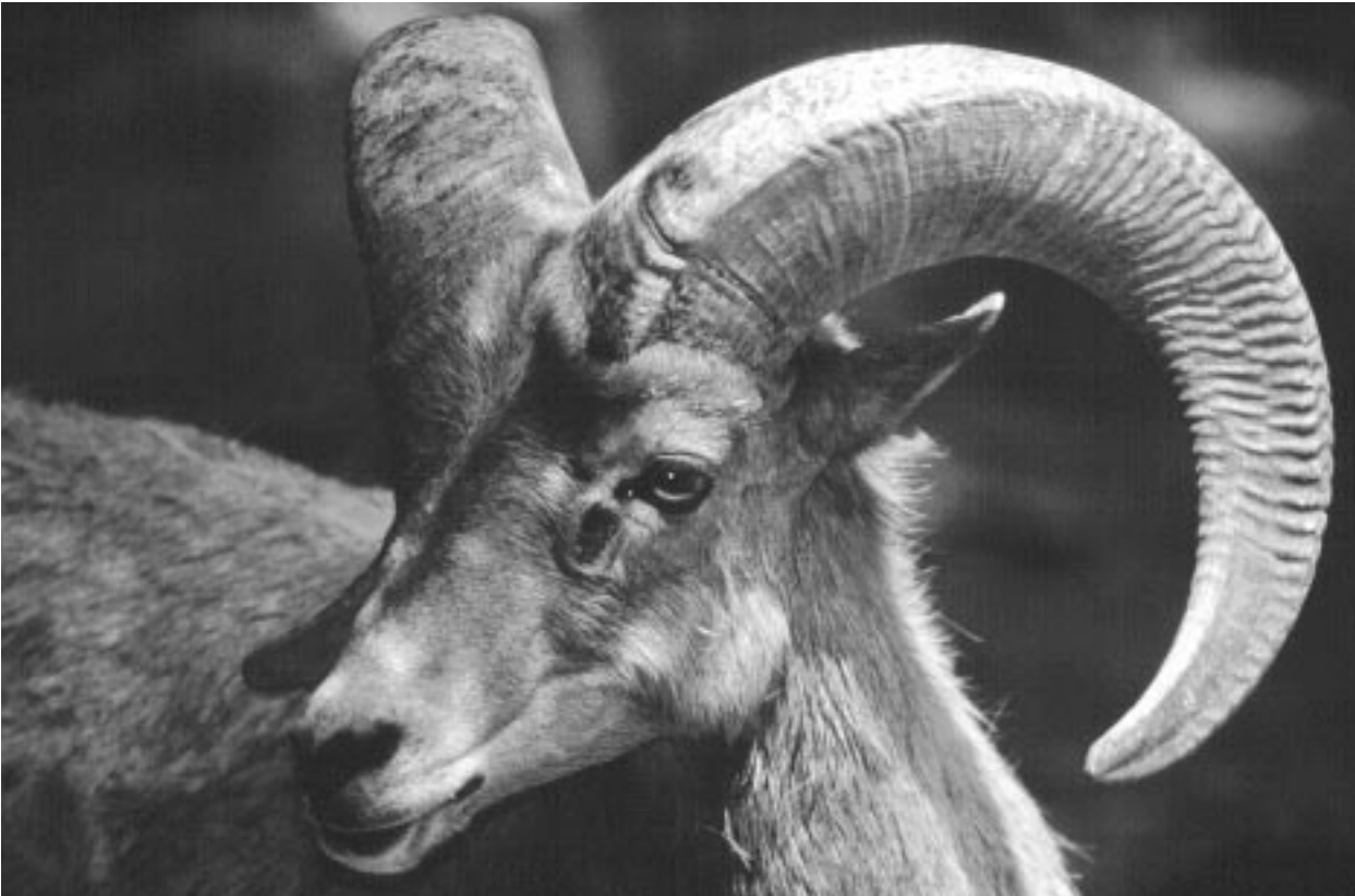
Desert bighorn sheep. Lynn B. Starnes, Fisheries, Albuquerque, New Mexico