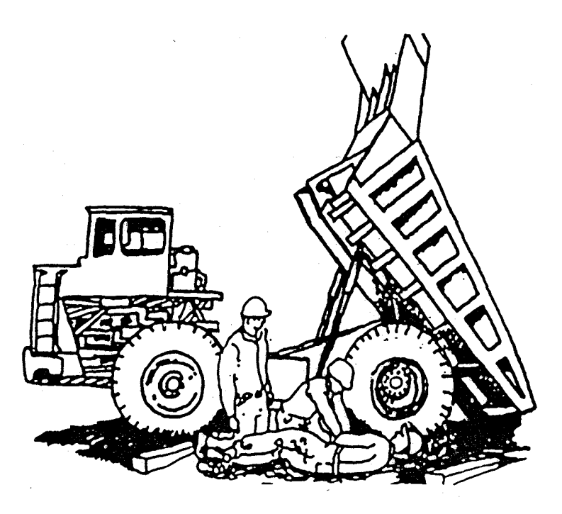
Figure 2: Harry falls to the ground, you and the driver try to help