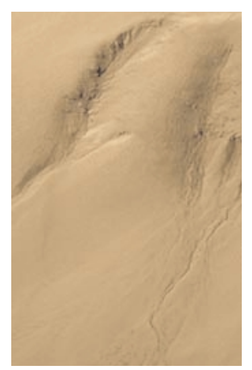
Signs of water erosion and debris flow are seen in this high resolution view of gullies eroded into the wall of a meteor impact crater in Noachis Terra on Mars, taken by NASA's Mars Global Surveyor.

Mars Global Surveyor was launched at 12:00:49 p.m. Eastern Standard Time on November 7, 1996,