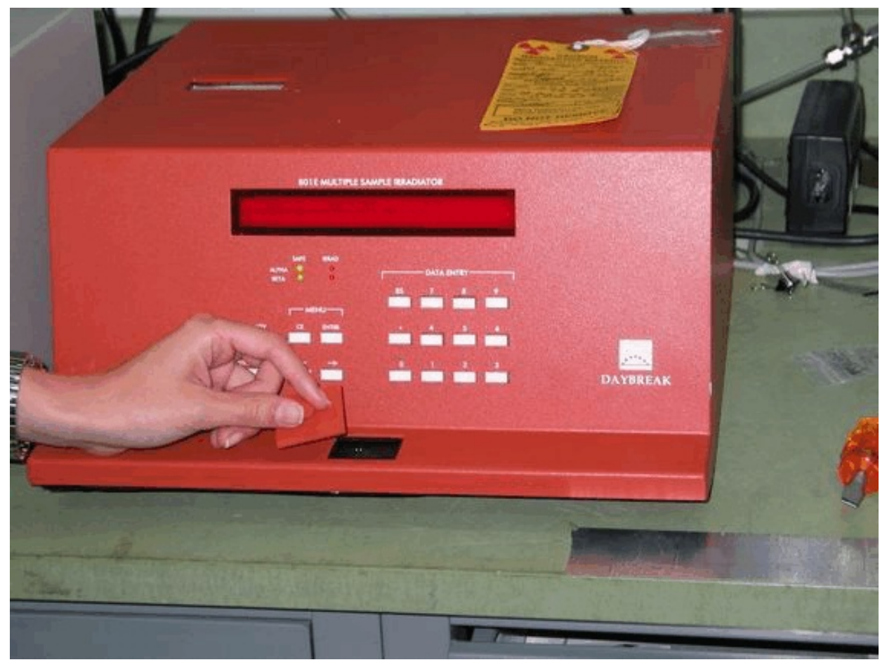
Figure 3 . Sample loading station on the Daybreak Model 801E Irradiator. Note the red LED readout and the programming keys on the front panel.

Use the arrow keys to highlight LOAD, and press <ENTER> when finished. The display shows the platter position that is at the load door on the front apron of the 801E, shown in Figure 3. The platter has a 0.5-mm-deep well for 10-mm-diameter sample disks or planchets at each position. There is a deeper well in the center of each position for 3-mm-square dosimeter chips as well.