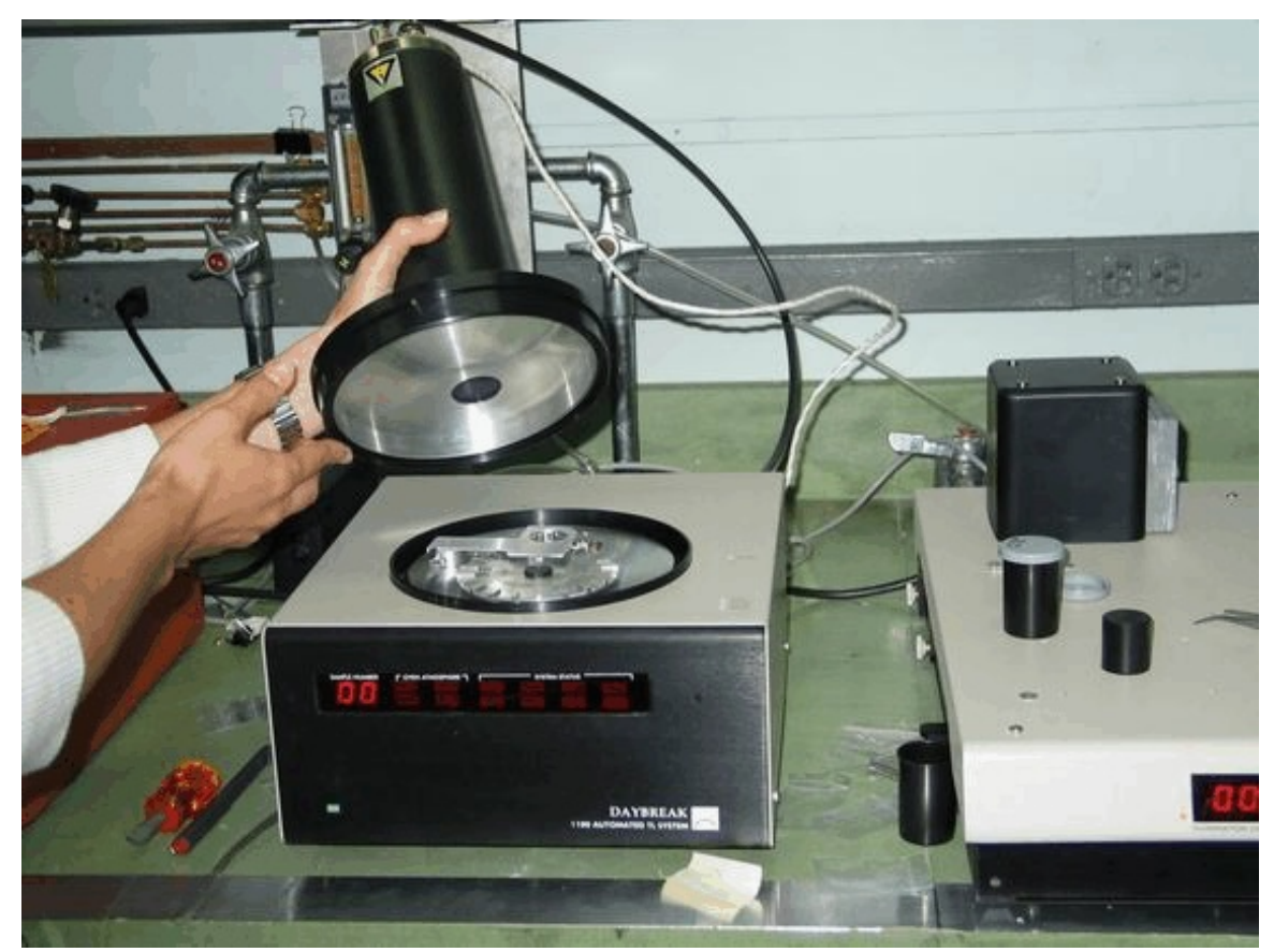
Figure 1 . Daybreak Model 1100 TL system with cover and PMT assembly removed for sample loading.