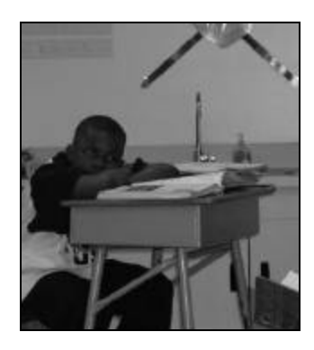
June is: National Safety Month

Asian Pacific American Heritage Month and Get Caught Reading Month