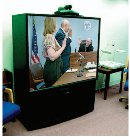
A claimant and representative (not shown) watch from a remote hearing site as expert witnesses are sworn in for a video hearing.

Video hearings can benefit claimants in two ways. Their hearings may be scheduled sooner than if they choose face-to-face hearings, and there may be a broader range of expert witnesses available. For example, a claimant in Sioux City, Iowa, can go to a video hearing location in his or her local community, rather than traveling nearly 200 miles to the hearing office in West Des Moines or waiting many months before an ALJ could travel to Sioux City. Video hearings