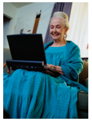
SSA now makes it possible for claimants to apply for benefits online.

To meet increasing public demands, SSA allows the public to apply for Social Security retirement, spousal, and disability benefits online in addition to applying in person or by phone. The online services provide opportunities for the public to conduct SSA business electronically in a private and secure environment. In 2004, 217,000 claimants submitted applications for Social Security benefits online, an increase of 47 percent over the previous year. Other online services allow current beneficiaries to check their benefits, enter changes to their address or direct deposit information, and obtain replacement 1099s and proof of income letters. These services can be accessed through SSA's website, www.socialsecurity.gov. SSA's online services provide greater convenience to the public while allowing the Agency to process its workloads more efficiently.