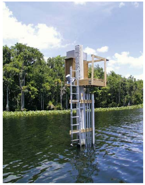
Figure 1-4. Stream gage at the Suwannee River above the Gopher River near Suwannee, Florida (7.6 miles upstream from the mouth of the Suwannee)

rate-dependent watershed parameters that govern the watershed response to the full range of possible hydrologic Hydrometeorological conditions. monitoring, communications, and computer technology used in stream flow forecast systems have advanced rapidly over the last few years. For operational forecasting, real-time stream flow data allows river forecasters to adjust model states or the projected hydrographs to match observed flows. Projected hydrographs at headwater points are routed downstream along with reservoir releases and intervening local flows. The routed flows must be converted to a stage at each forecast point. Stage-discharge relationships developed and maintained by the USGS and other partners are based on periodic on-site stream flow measurements and are essential to NWS hydrologic forecast and warning operations.