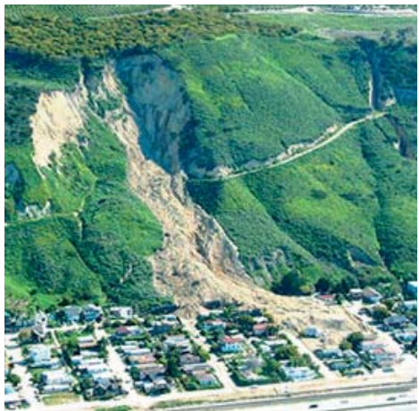
Figure 1-1. Landslide in La Conchita, California, 2005.

prone regions have greatly reduced fatalities from wind damage, but many fatalities continue to result from tropical cyclone-induced inland flooding. To provide reliable scientific information, the hydrometeorologist measures tide levels, wind direction and speed, barometric pressure, and rainfall rates to describe and forecast inland flooding events.