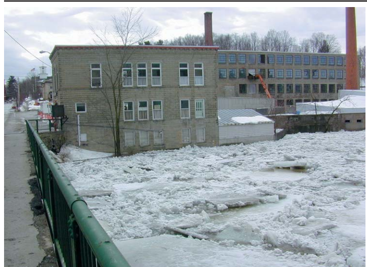
Figure 1-3. Ice jam around Big Island in Richford, Vermont, March 15, 2007.

ical products and services that provide a vital foundation for numerous applications and users, including transportation, agriculture, water supply and flood control, are flood watches and warnings, drought outlook, water supply outlook, ice forecasts, and quantitative precipitation forecasts (QPF). Federal, state, and local agencies are working together to improve these products and services which help mitigate the socioeconomic impacts of hydrometeorological events. Understanding the importance of these products and services requires understanding of how the information is created, communicated, and used. The different perspectives of the hydrometeorological community and its stakeholders, regarding the use of these products and services, are a key consideration as well.