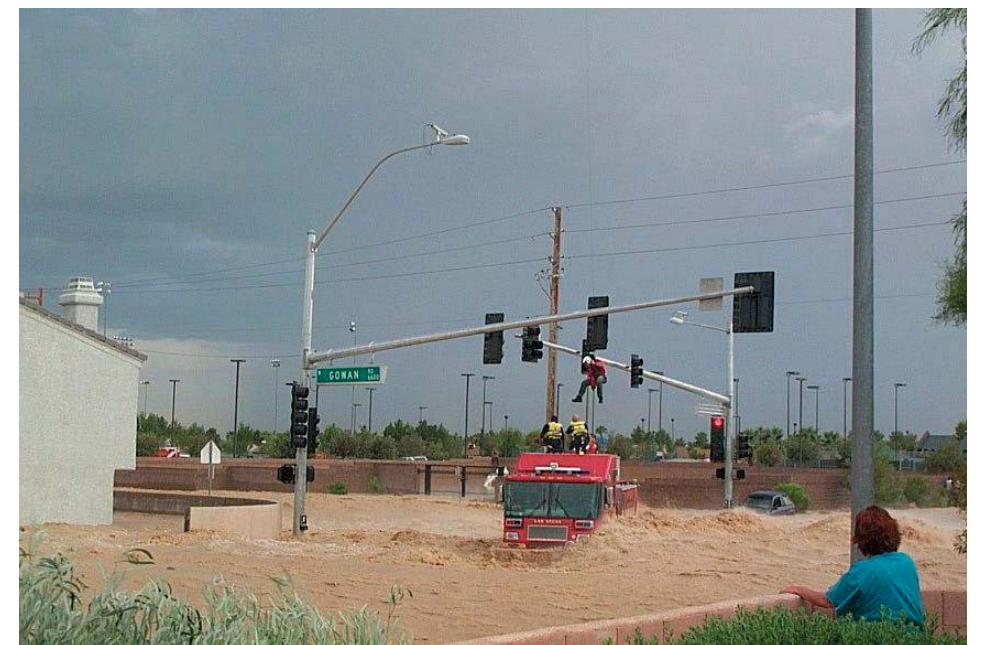
Figure 1-2. Flash flood in Las Vegas, NV, August 19, 2003.