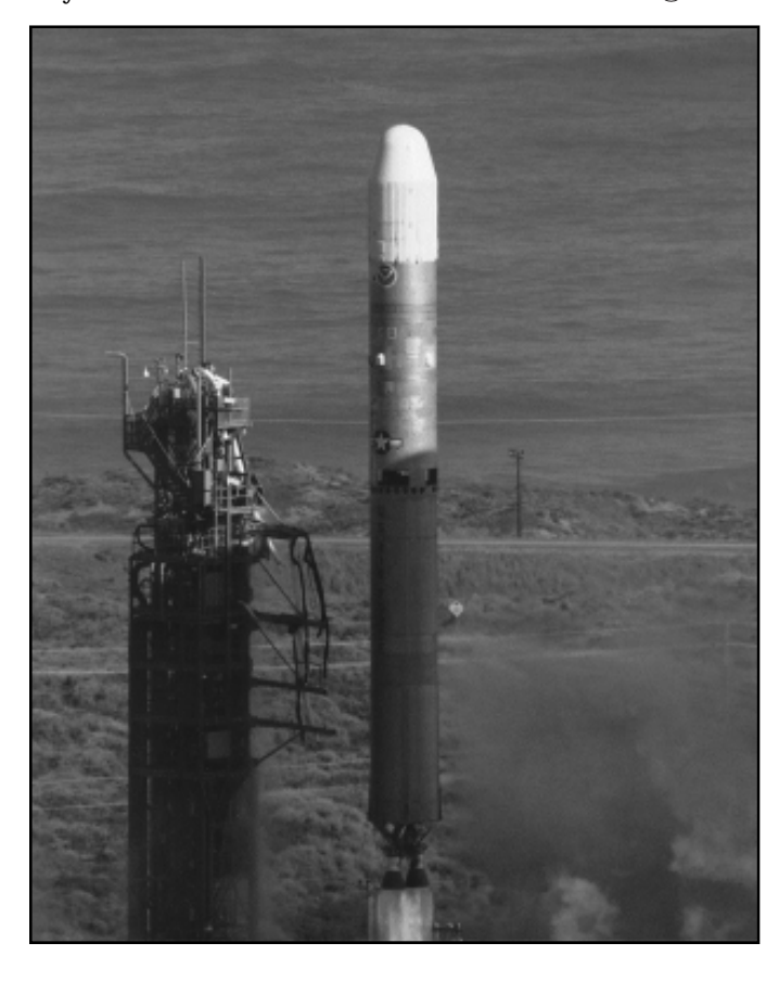
The NOAA-K satellite blasted off from Vandenburg Air Force Base in California.