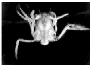
Figure 3. Larval crab from the Gulf of the Farallones, greatly magnified.