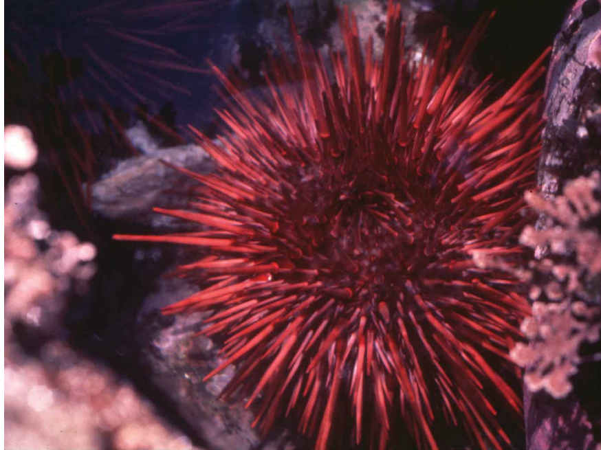
Figure 1. Red sea urchins, harvested for sushi, are one of many commercially important coastal species in the Gulf of the Farallones with swimming larval forms that drift as plankton during the spring.