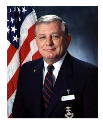
"Strive to be as sharp-looking as possible"