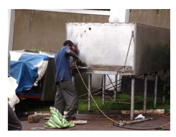
A cooler being repaired at the Land O'Lakes' Office in Kampala.

The cooler tank shells are virtually indestructible, so the repairs consist of installing new condensers, tubing, milk paddles and a control board.