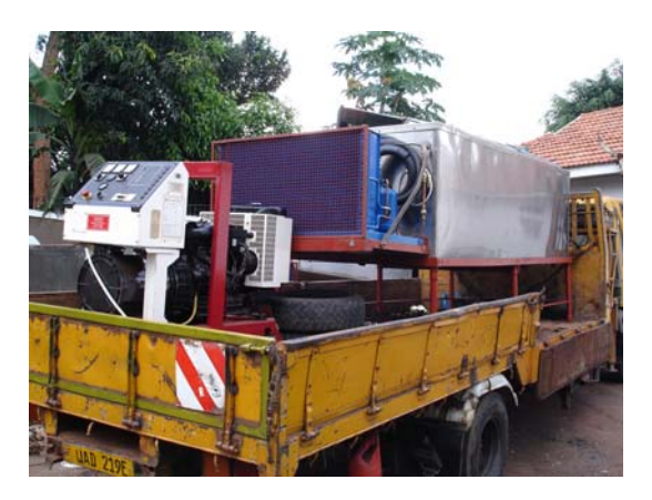
A newly refurbished cooler ready for a farmer cooperative.

All of these coolers will be handed over to farmer groups on a payback scheme so a sense of ownership is established. The money collected will go into a fund that DDA will use to repair more coolers.