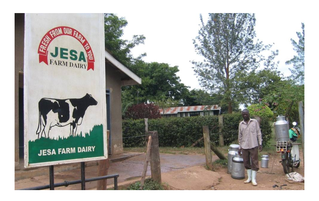
Farmer delivering milk to Jesa Farm Dairy

Jesa Farm Dairy was successful even before the assistance of the Land O'Lakes Dairy Project, but the project has helped this medium-sized dairy processor in three important ways – securing milk from small producers, assisting it to receive a health quality certification for its dairy products, and helping it to improve its marketing strategy.