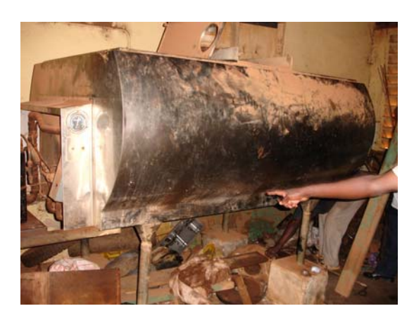
One of the abandoned coolers in Nakasongola/Luwero milk shed.

Land O'Lakes, working with the Ugandan Government Dairy Development Authority (DDA) conducted a survey on bulking infrastructure problems in the country. This revealed that they were many milk coolers lying idle in the countryside that were still in repairable condition. Some of these coolers dated as far back as the 1960s. These are coolers that were installed in the 1970's by the then government owned Dairy Corporation.