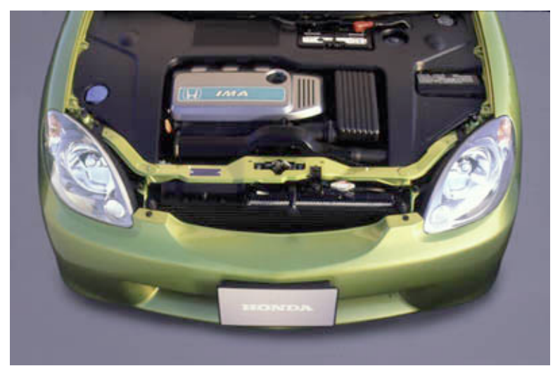
Figure. Engine of a hybrid automobile (Honda Civic).

speed picked up when descending a hill) back into stored chemical energy in the rechargeable battery. Hybrid engines are becoming very popular, and in a few years, they may be the most common type of automobile, particularly if gasoline prices rise.