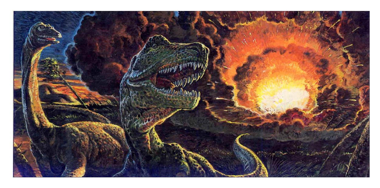
painting by John Dawson