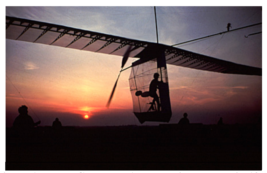
Figure 1.4. The Gossamer Albatross in England in 1979

Over a sustained period of time, a typical person riding a bicycle can generate power at the rate of about 1/7 = 0.14 = 14% of a horsepower. (Does that seem reasonable? How much does a horse weigh compared to a person?) A trained cyclist in excellent physical condition can do better: about 0.4 horsepower for several minutes. In 1979, cyclist Bryan Allen used his own power to fly a super-light airplane, the Gossamer Albatross, across the 23 mile wide English Channel (Figure below).