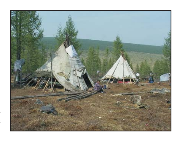
A camp of Tsaatan (Dukha) reindeer herders in the mountainous region of northern Mongolia.

Lawrence Gateways Project." The project is aimed at documenting various local prehistoric cultures starting from 8,000 years ago. It also explores the impact of colonial trade and culture contacts on local indigenous residents, when European sailors, primarily the Basques and the French, became established in the region around the year 1600. The surveys are authorized by the Quebéc Ministry of Culture and Communications and funded by the Smithsonian and private donors.