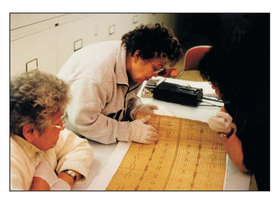
Aleutian elders work with objects from their area in the Smithsonian collection.

newsletter is a valuable source of information to northern scholars (both in the U.S. and worldwide), policy makers, northern residents, and community institutions on the wide range of Smithsonian activities. The projects described below offer a few illustrations of the breadth of the Smithsonian approach and its special focus on collaboration with other agencies and northern communities.