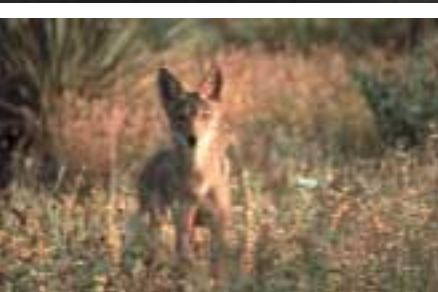
Coyote songs fill the night air.