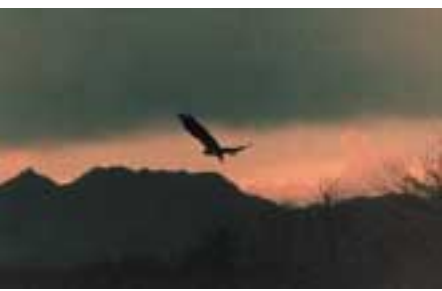
Raptors can be seen hunting over open grasslands.