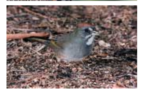
Listen for greentailed towhee scratching under shrubs.