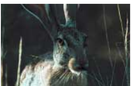
Like their namesakes, antelope jackrabbits display a white rump patch when running.