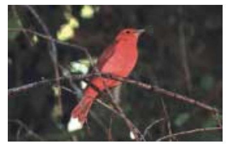
The Creek is alive with calls from summer tanagers and yellowbreasted chat in summer.