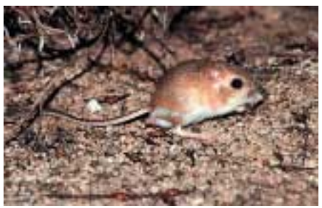
Kangaroo rats come out at night, but you will notice their large mounds anytime.