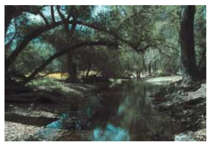
Arivaca Creek. Shady trails at Arivaca Creek are especially good for woodland birds in spring and summer.

Arivaca Creek: Giant cottonwoods and lush vegetation attract songbirds, woodpeckers, owls, and coatimundi to the stream's banks. A short trail leads to the stream's edge next to the home of Eva Wilbur-Cruce who wrote about growing up here in A Beautiful Cruel Country (please observe No Trespassing signs at private property).