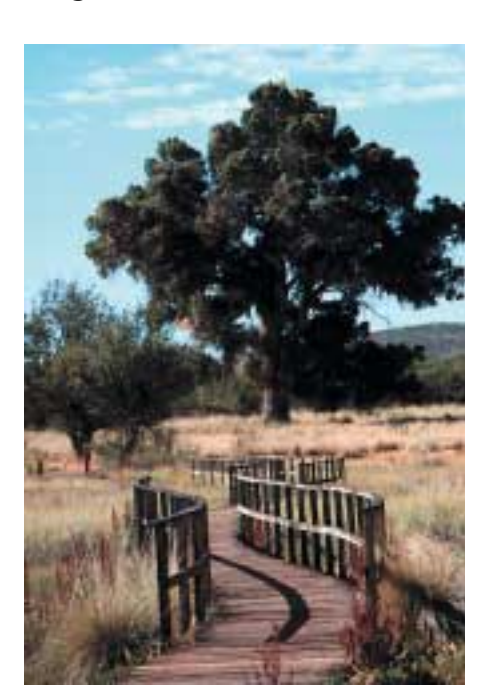
Avivaca Cienega Boardwalk. Boardwalks at Arivaca Cienega provide close up views of vermilion flycatchers.