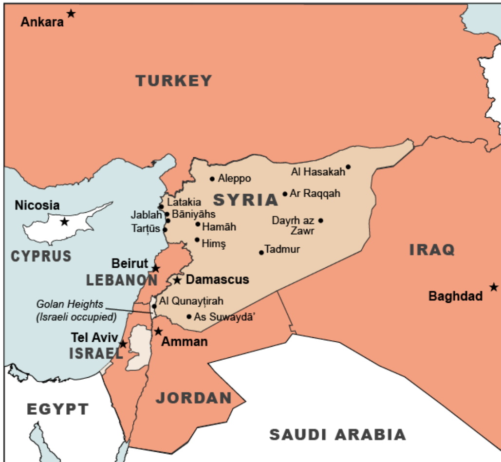
Figure 2. Map of Syria