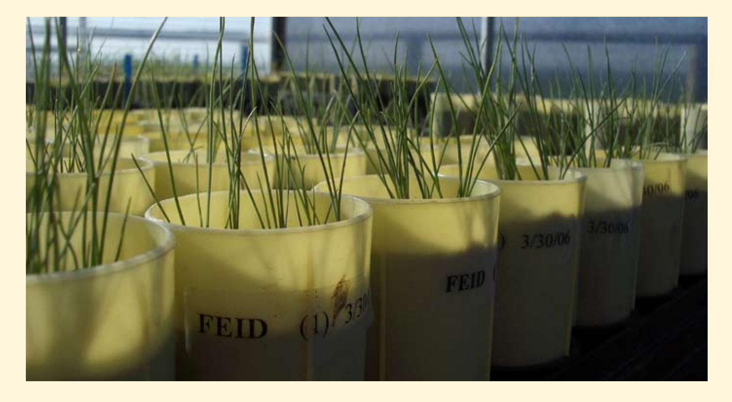
Photo 5. In riparian areas, greenhouse-grown plugs have a much higher establishment rate than straight seeding.

Planting nursery stock can complement reseeding and increase the chances of revegetation success with rapid plant establishment. Planting also circumvents the critical germination and establishment stages. Purchased stock can be costly. However, planting fewer individuals in "islands" where central, established stands of plants can reproduce and eventually spread may reduce costs. The results of such "islands" will be long term. An immediate increase in the number of nonseeded species resulting from this practice should not be anticipated. Areas can be "island seeded" by using a drill seeder to seed wide strips. Over time, the