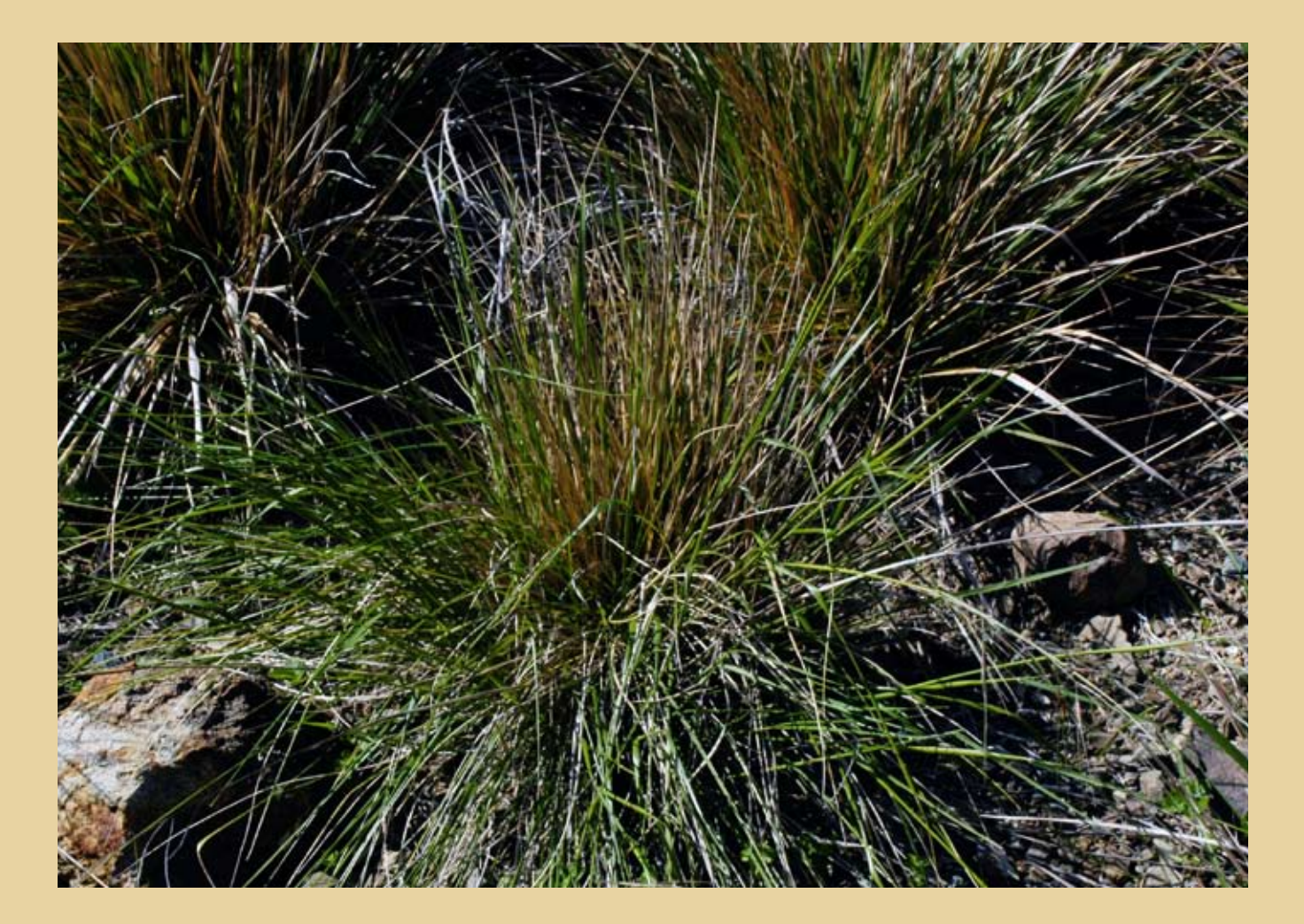
Photo 2. Idaho fescue is a native, low-growing bunchgrass. Its short stature reduces the need for mowing maintenance, making it a good choice for roadsides.

and self-perpetuate. Whenever practicable, select and distribute native species based on ecological criteria. Native grasses, such as Idaho fescue (Festuca idahoensis) , Sandberg's bluegrass (Poa secunda) , and 'Nortran' tufted hairgrass, are short-growing and can significantly reduce costly roadside mowing maintenance (photo 2). Also, consider the species' ability to minimize soil erosion and tolerate disturbance. Rhizomatous species with extensive root systems are a good choice. For instance, streambank and thickspike wheatgrass (Elymus lanceolatus and E. macrourus, respectively) are strongly rhizomatous with excellent seedling vigor. They are frequently used for road-