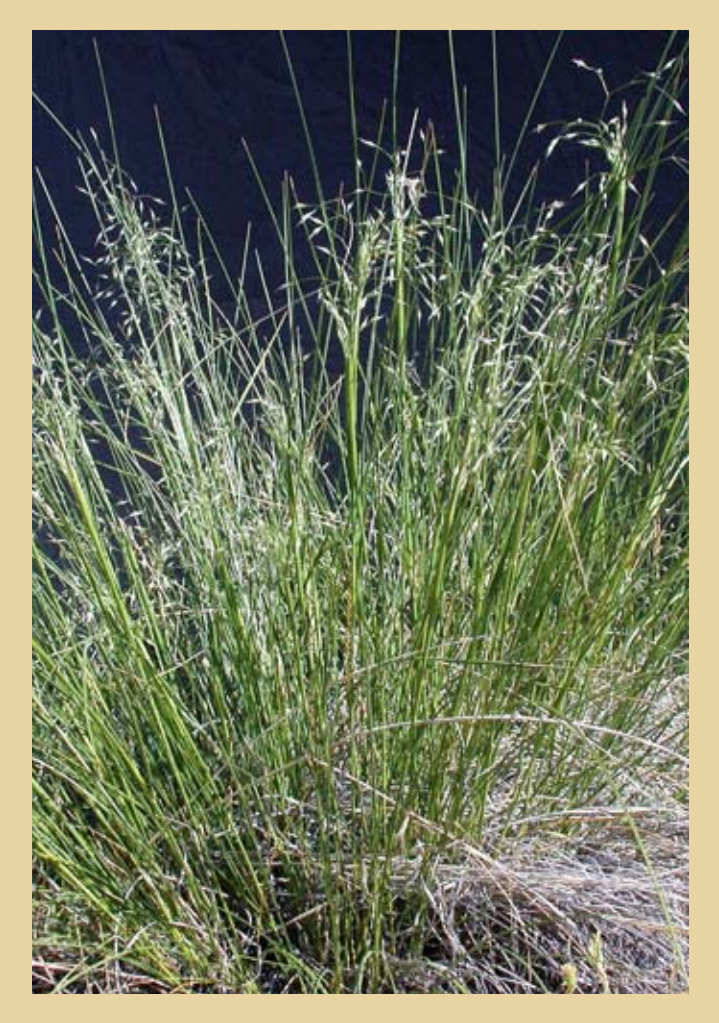
Photo 7. Indian ricegrass is a native bunchgrass that requires cold stratification to break dormancy. This can be provided with a fall-dormant seeding.

Dormant seedings should occur after the soil temperature has fallen below 50 °F for 1 to 2 weeks. This period is usually during late fall (that is, late October and early November), just before the soil freezes and when temperatures and moisture remain low enough to prevent germination. Dormant