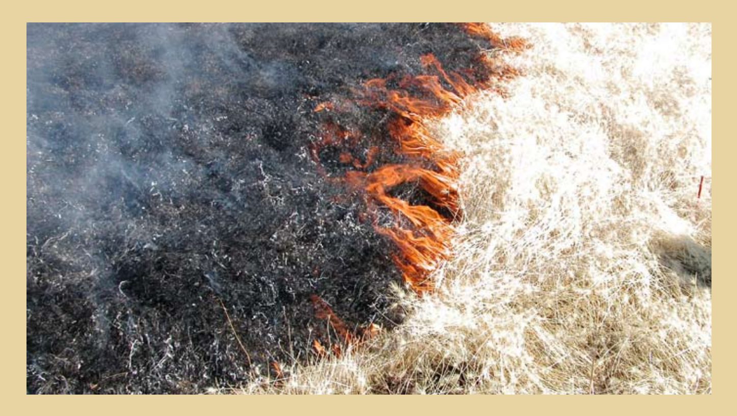
Photo 1. Ash produced by a fire provides an excellent seedbed. A fall-dormant broadcast seeding into the ash layer will cover and retain seeds until suitable conditions exist for germination the following spring.

Burned-area revegetation typically does not require seedbed preparation if the reseeding immediately