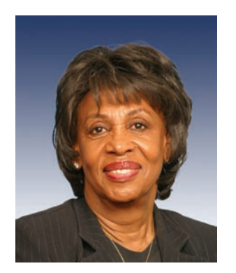
Rep. Maxine Waters of Los Angeles (35th District) Democrat—9 terms