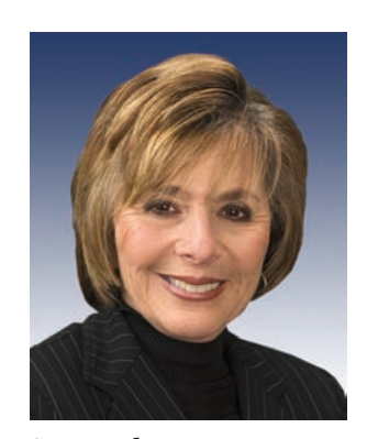
Sen. Barbara Boxer of Rancho Mirage Democrat—Jan. 3, 1993