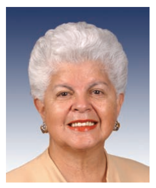
Rep. Grace F. Napolitano of Norwalk (38th District) Democrat—5 terms