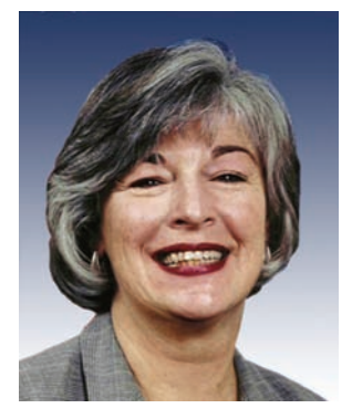
Rep. Lynn C. Woolsey of Petaluma (6th District) Democrat—8 terms