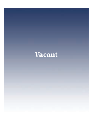
Vacant (37th District)