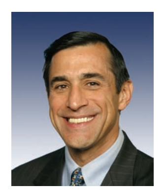
Rep. Darrell E. Issa of Vista (49th District) Republican—4 terms