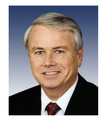
Rep. Elton Gallegly of Simi Valley (24th District) Republican—11 terms