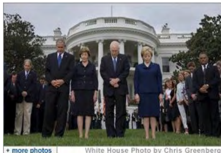
President George W. Bush, Mrs. Laura Bush, Vice President Dick Cheney and Mrs. Lynne Cheney bow their heads for a moment of silence on the South Lawn of the White House Tuesday, Sept. 11, 2007, in memory of those whose lives were lost on Sept. 11, 2001.