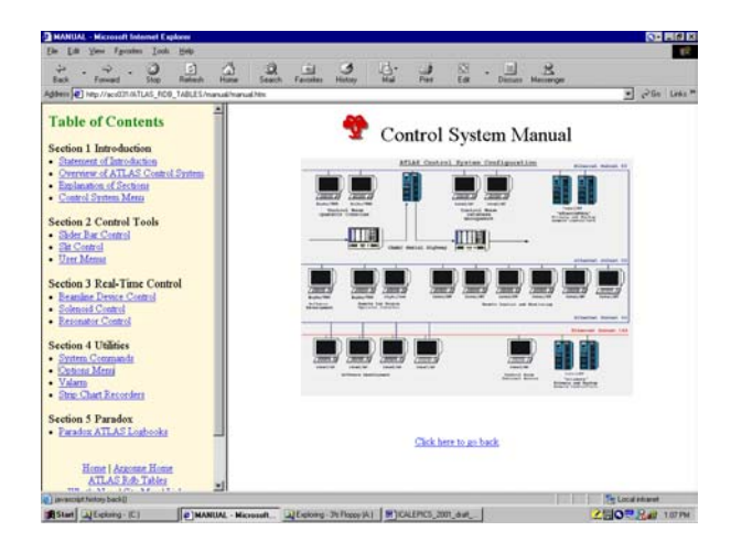
Figure 2: Online Operators' Control System Manual

The Web server software for the ATLAS Control System website is Microsoft IIS (Internet Information Server) [6]. Microsoft IIS is part of the Windows NT 4.0 Option Pack, and is integrated with the Windows NT Server operating system. The control system web