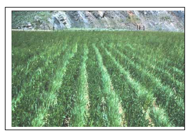
Alternate Row Planting

Stands are often open because Russian wildrye is usually seeded with wide row spacing, leaving the soil between plants susceptible to erosion. It should be planted on the contour where slopes are greater than 2 percent or may not be desirable at all where erosion control is the most important objective. Forage yields are similar to those of crested wheatgrass. Wide row spacing increases forage production.