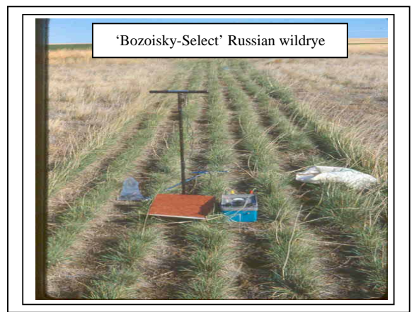
Bridger PMC - Salinity Study

It grows at elevations up to 7,500 feet in northern latitudes and to 9,000 feet in southern latitudes. Wide row spacing plantings (18 to 36 inch) produce more forage than narrow row spacing (6 to 14 inch) plantings.