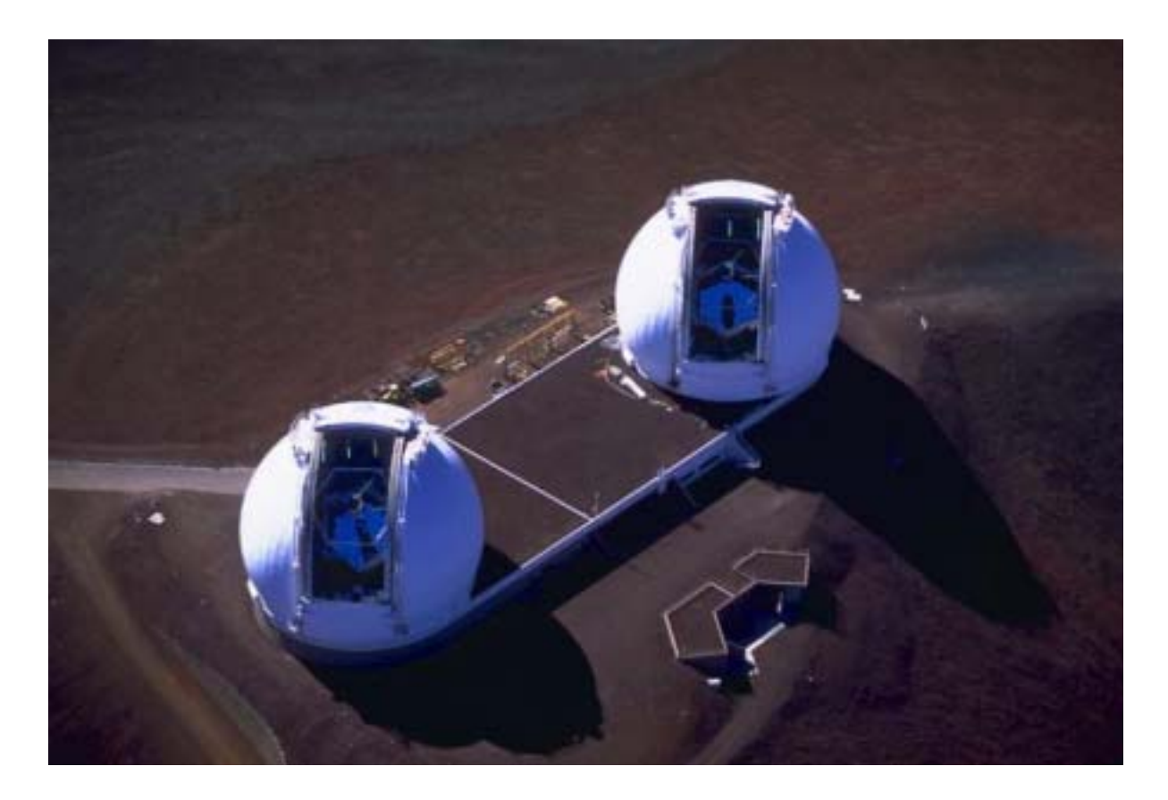
Figure 4. The two 10 Meter Keck Telescopes on Mauna Kea, Hawaii.