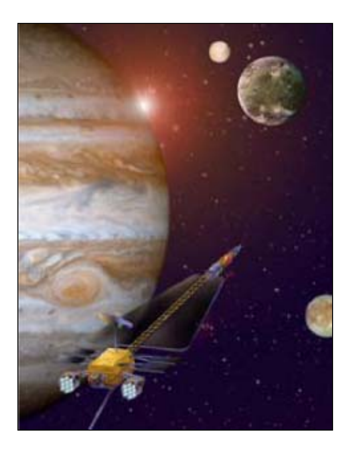
Figure 2. Artist rendition of the Jupiter Icy Moon Orbiter (JIMO) mission. The space fission reactor is at the tip far from the spacecraft body. Large radiators are used to dissipate excess heat. The ion engine clusters are shown.