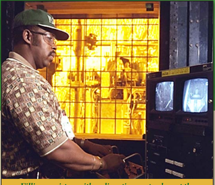
Filling canisters with radioactive waste glass at the Defense Waste Processing Facility

The Mound Closure Project Radioisotope Thermal Generator (RTG) cleanup project was the working demonstration site to demonstrate the Actinide X-Ray In Situ Scanning System (AXISS) that was developed to achieve quantification of plutonium-238 at 30 pCi/g . This system allowed project personnel to monitor the soil cleanup and to ensure that haul roads did not become contaminated and further risk the transport of contaminated soil off site.