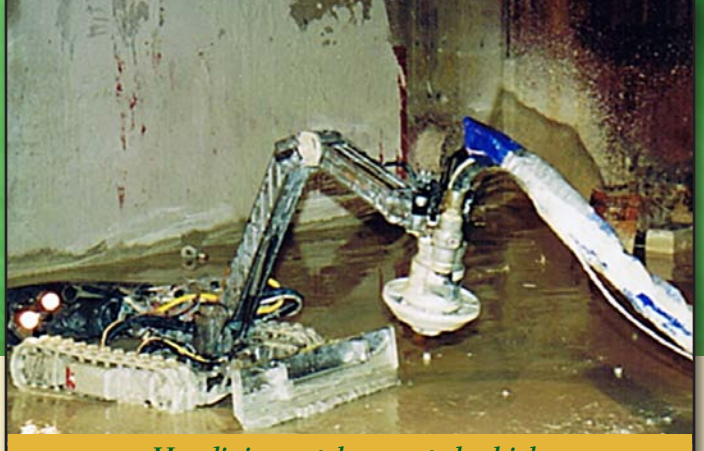
Houdini remotely operated vehicle