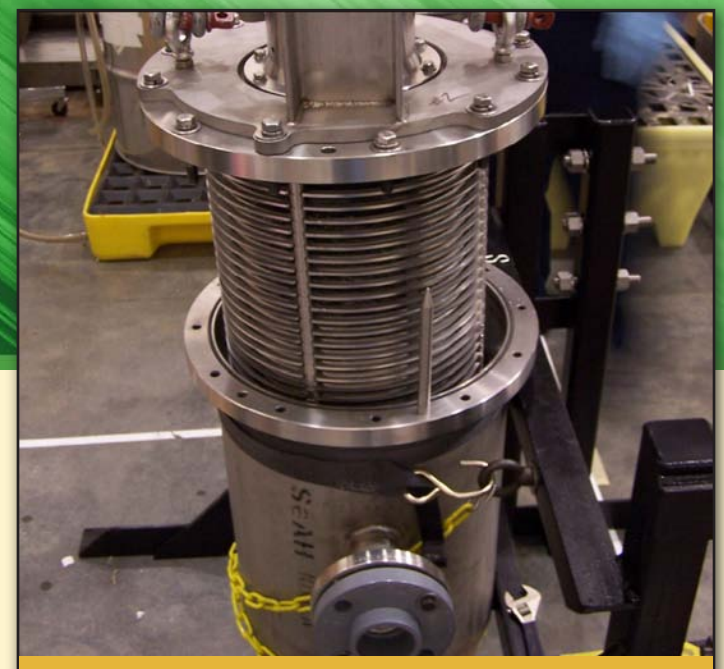
Rotary microfilter being inserted into its housing