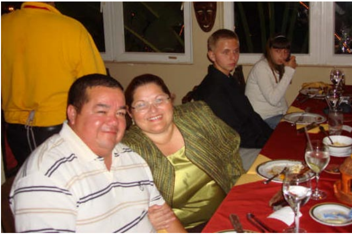
Restaurant Night at Humidor Churrascaria