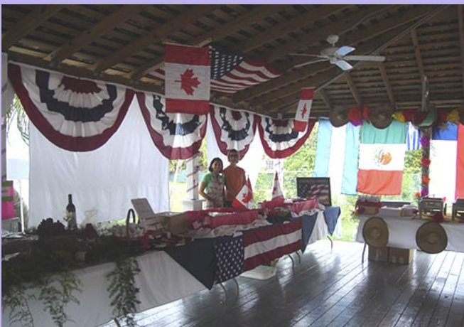
North American Booth At Lyford Cay International School Fun Day

Send in your photos to be featured in the Photo Gallery!