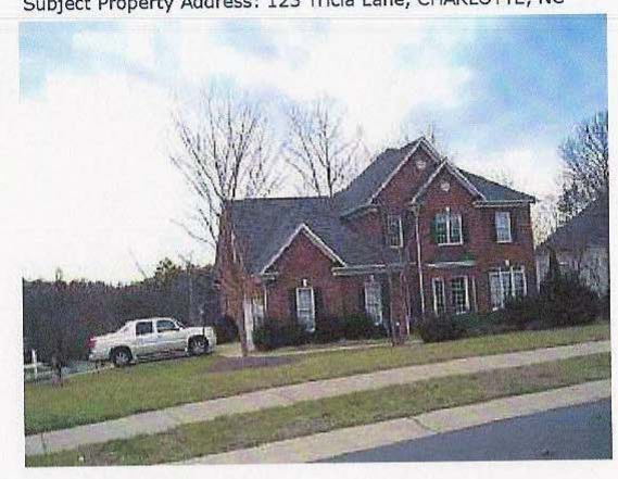
Photo #1: Subject Property Front View Subject Property Address: 123 Tricia Lane, CHARLOTTE, NC