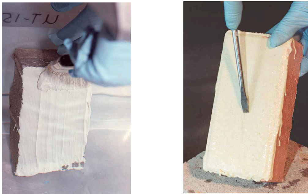
Figure 1. UT-15 adhered well to all surfaces when applying and after drying.

Based on these results, use of the UT-15 (Figure 1) and the NMP 1710 coatings were recommended for use in the actual fuel basins.