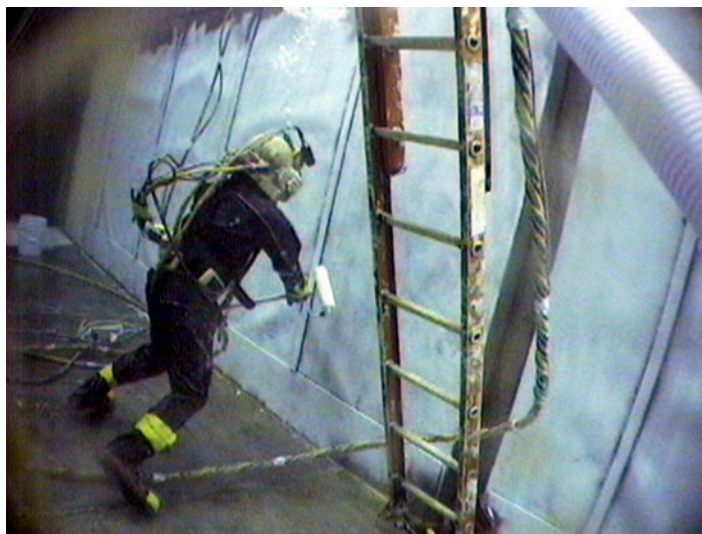
Figure 3. Applying fixative to the wall of the MTR canal.

After the epoxy fixative coating passed inspection, water was removed from all four basins. The fixative minimized the risk of airborne contamination by trapping residual contamination on the basin walls. This allowed the pool deactivation goals to be safely met and marked another milestone in closing facilities at the INL which are no longer needed to help ensure US civilian and energy safety.