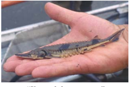
"Young lake sturgeon"

length of 20 in and a weight of 1 lb. Females do not reach sexual maturity until ages 24-26, while males may mature in 15-17 yrs. Individuals 40