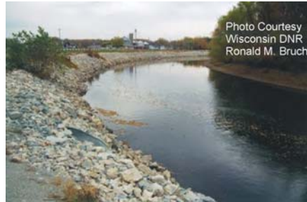
sturgeon Shoreline riprapping applied to population in enhance sturgeon spawning habitat.

Lake Winnebago system was stable during the 1930's and 1940's, but the population increased after property owners began riprapping riverbanks with large rock in the 1950's to reduce erosion. The riprapped shorelines greatly increase the area suitable for successful spawning. Also, a group of volunteers in Wisconsin called the "Sturgeon Patrol" has actively protected sturgeon from poaching during their vulnerable spawning period.