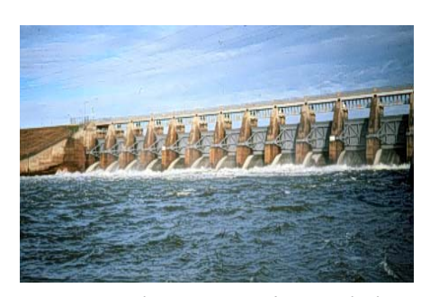
Dams occuring on many large Mississippi River Basin rivers hinder upstream lake sturgeon movements.

about 20 years of fishing pressure before reaching maturity and gaining its first opportunity to spawn or reproduce itself. The