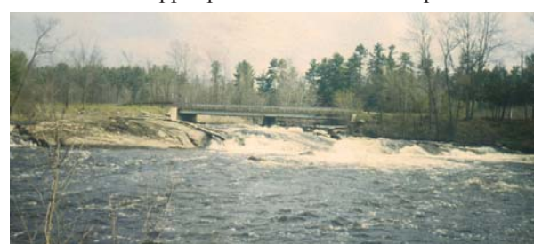
Typical lake sturgeon spawning habitat.

are rapidly strained and retained, while the soft bottom materials are puffed out through the gills. Insect larvae found in the forward portion of their stomachs are usually undamaged and still alive. Stomachs of larger fish have been found to contain a water-displaced volume of up to 66 oz of midge larvae, estimated to number about 60,000 individuals. Lake sturgeon feed throughout the winter at water temperatures ranging down to 34 °F. Adults typically migrate up rivers to spawn in the spring, moving as much as 120 mi. Large, adhesive eggs are deposited on gravel and rock riffles of streams and rivers. Spawning typically occurs from April through June in Wisconsin, at water temperatures ranging from 54-65 °F. Groups of a dozen or more males aggregate in near shore, shallow water areas, often with the upper parts of their bodies exposed.