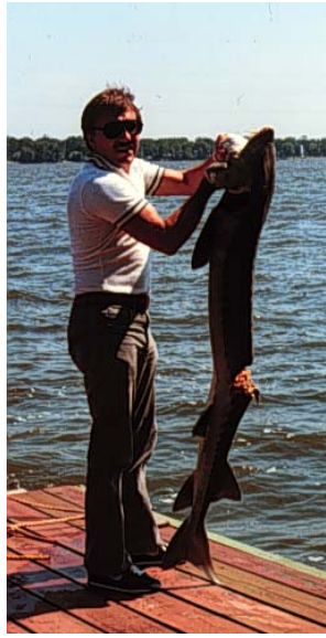
Lake sturgeon killed by propellor impact in Pool 15, Upper Mississippi River in the mid 1980's.

proliferation of dams throughout North America also prevented fish from reaching former spawning grounds. Spawning habitats and food resources (i.e. mussels and gastropods) were also destroyed by siltation, pollution, channelization and drainage of streams and lakes. The lake sturgeon is also subject to direct loss by impact with large boats, such as was documented by a fish collected in Pool 15. Upper Mississippi River in the mid 1980's (see photo at right).