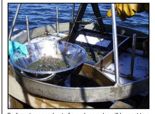
Sediment scooped out of a grab sampler will be sent to a laboratory for chemical testing.