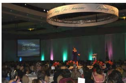
Governor Lingle shares aloha