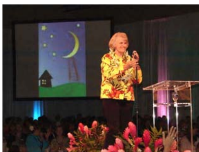
Former Astronaut Shannon Lucid encourages "reaching for the moon."