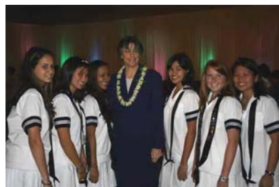
Governor Lingle with student participants