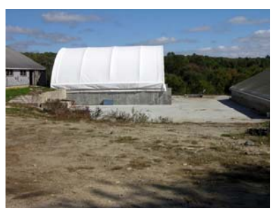
Manure waste storage on the Howard Farm