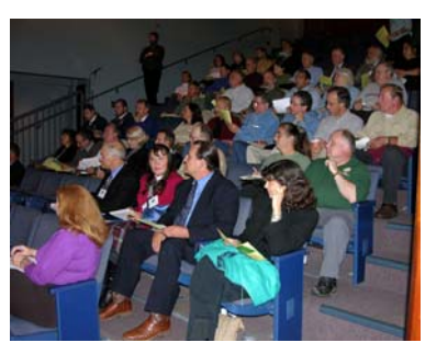
Conference at URI