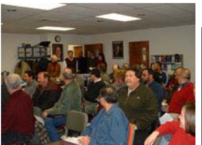
Aquaculture Workshop held in Warwick, RI