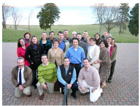
RI NRCS Staff