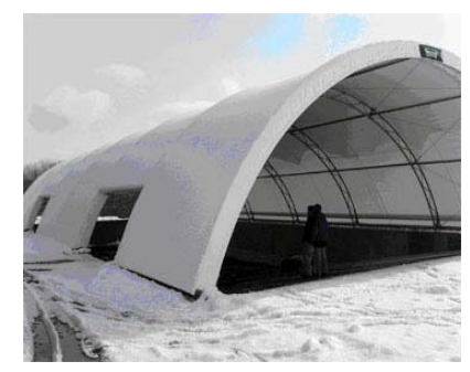
Manure storage structure

"A bubbling delirium of ecstatic music that flows from the gifted throat of the bird like sparkling champagne",