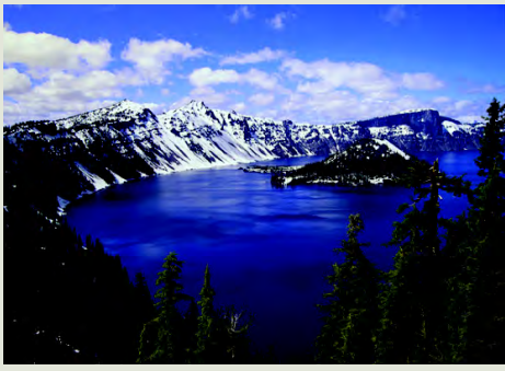
Crater Lake National Park, Oregon