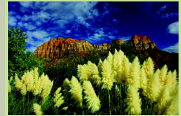
Zion National Park, Utah