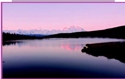
Denali National Park and Preserve, Alaska