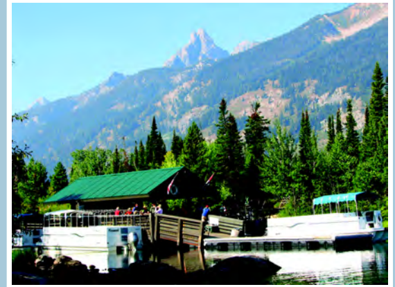
Dock at Jenny Lake Boating in Grand Teton National Park, Wyoming