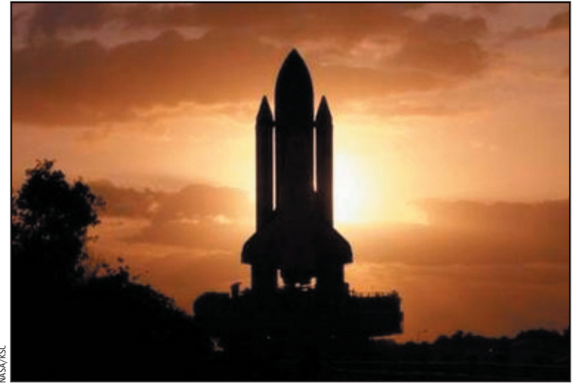
Space Shuttle Atlantis as it moved toward Launch Pad 39A at the Kennedy Space Center, Fla., on May 15.

atop the launcher pedestals at Center, Fla., on May 15. Launch Pad 39-A at 10:47 a.m. The total trip time was six hours and 45 minutes. Electrical and mechanical connections of Atlantis to the launch pad are under way. With the refurbishment of Pad 39-A, this launch will be the first from the pad in four years.