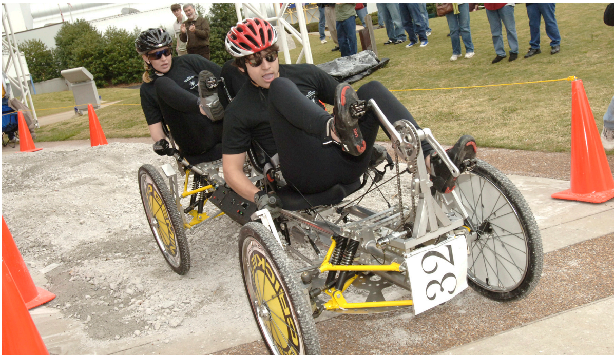
A pair of racers representing the Huntsville Center for Technology in Huntsville, Ala., speed toward the 2007 high school division trophy in NASA's 14th annual Great Moonbuggy Race.

Today's Students, Tomorrow's Engineers and Space Explorers