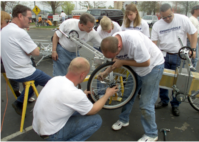
The challenging course keeps moonbuggy pit crews, like these 2001 racers, busy on race day, welding snapped struts and replacing bent wheels and broken sprockets.