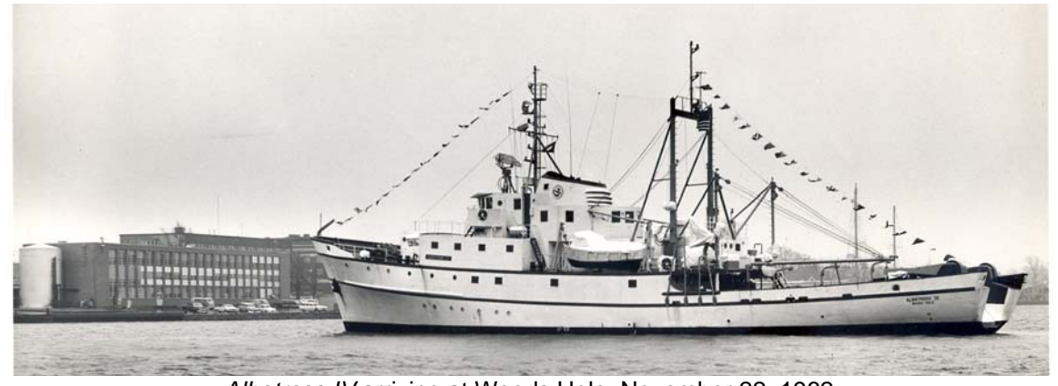
Albatross IV arriving at Woods Hole, November 22, 1962

Northeast Fisheries Science Center Pier Woods Hole, Massachusetts