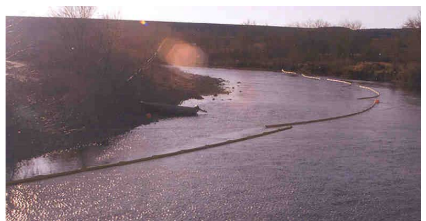
Figure 3.Photograph of Cascade Diversion Booming