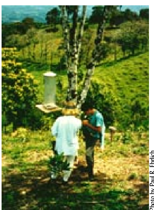
Figure 5-Trapping and releasing butterflies in a mixed-agriculture landscape in Costa Rica. Monitoring the impact of human activities on biodiversity and ecosystem

during transitions between interglacial periods and ice ages. One example: When climatic cooling leads to drops in sea level, continental shelves are exposed to wind and rain, causing greater nutrient runoff to the oceans. These nutrients may fertilize the growth of phytoplankton, many of which form calcium carbonate shells. Increasing their populations would remove more carbon dioxide from the oceans and the atmosphere, a mechanism that should further cool the planet. Living things may also enhance warming trends through such activities as speeding up microbial decomposition of dead organic matter, thus