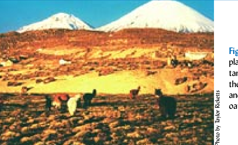
Figure 3 -Alpaca grazing on the Chilean altiplano. Grassland ecosystems are an important source of animal products; they are also the original habitat of most domestic animals and many crops, such as wheat, barley, and oats.

Natural ecosystems also produce vegetation used directly by humans as food, timber, fuelwood, fiber, pharmaceuticals and industrial products. Fruits, nuts, mushrooms, honey, other foods, and spices are extracted from many forest species. Wood and other plant materials are used in the construction of homes and other buildings, as well as for the manufacture of furniture, farming implements, paper, cloth, thatching, rope, and so on. About 15 percent of the world's energy consumption is supplied by fuelwood and other plant material; in developing countries, such "biomass" supplies nearly 40 percent of energy consumption (Hall et al. 1993), although the portion of this derived from natural rather than