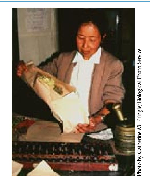
Figure 7 -Herbal pharmacist in Dali, Yunnan Province, China. An estimated 80 percent of the world's population relies on natural medicinal products.

In addition to protecting soil from erosion, living vegetation—with its deep roots and above-ground evaporating surface—also serves as a giant pump, returning water from the ground into the atmosphere. Clearing of plant cover disrupts this link in the water cycle and leads