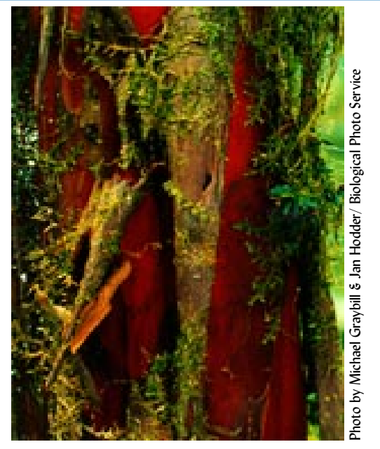
Figure 6 -Bark of the Pacific yew tree ( Taxus brevifolia ), which is the source of the new anti-cancer drug, taxol, Willamette National Forest, Oregon.

releasing carbon dioxide to the atmosphere (Schneider and Boston 1991; Allegre and Schneider 1994). The relative influence of life's stabilizing and destabilizing feedbacks remains uncertain; what is clear is that climate and natural ecosystems are tightly coupled, and the stability of that coupled system is an important ecosystemservice.