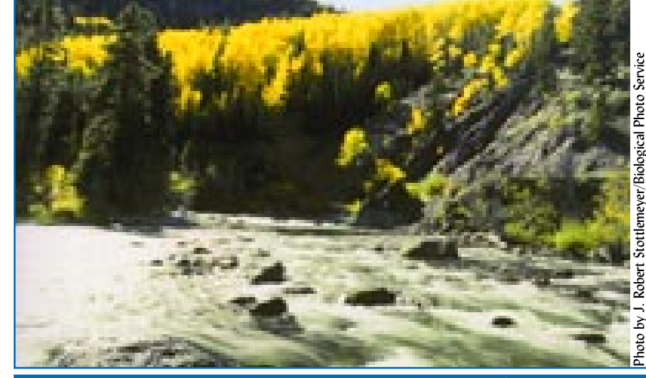
Figure I -Aspen ( Populus tremuloides ) forest in Colorado, filtering and purifying air and water.

Although the distinction between "natural" and "human-dominated" ecosystems is becoming increasingly blurred, we emphasize the natural end of the spectrum, for three related reasons. First, the services flowing from natural ecosystems are greatly undervalued by society. For the most part, they are not traded in formal markets and so do not send price signals that warn of changes in their supply or condition. Furthermore, few people are conscious of the role natural ecosystem services play in