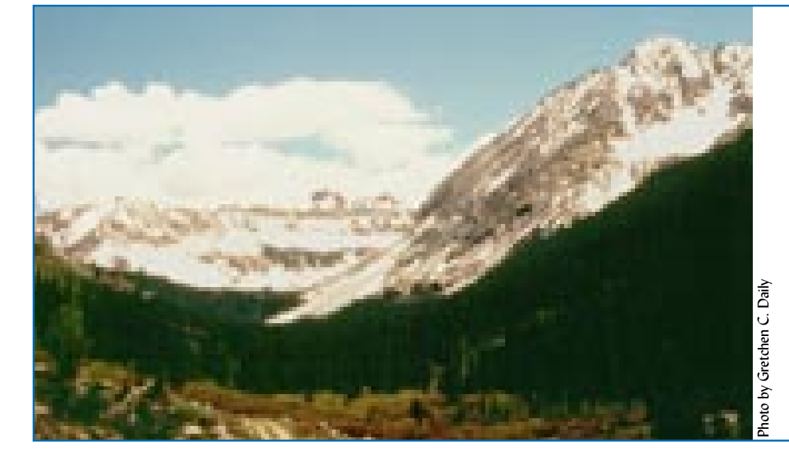
Figure 8-Early summer in the Colorado Rockies. These subalpine forests mitigate flood, drought, and temperature extremes; they soak up rain and snowmelt and mete it out gradually to streams and to the atmosphere, creating cooling afternoon thunderstorms.

to potentially large increases in surface runoff, along with nutrient and soil loss. A classic example comes from the experimental clearing of a New Hampshire forest, where herbicide was applied to prevent regrowth for a 3-year period after the clearing. The result was a 40 percent increase in average stream flow. During one four-month period of the experiment, runoff was more than 5 times greater than before the clearing (Bormann 1968). On a much larger scale, extensive deforestation in the Himalayan highlands appears to have exacerbated recent flooding in Bangladesh, although the relative roles of human and natural forces remain debatable (Ives and Messerli 1989). In addition, some regions of the world, such as parts of Africa, are experiencing an increased frequency and severity of drought, possibly associated with extensive deforestation.