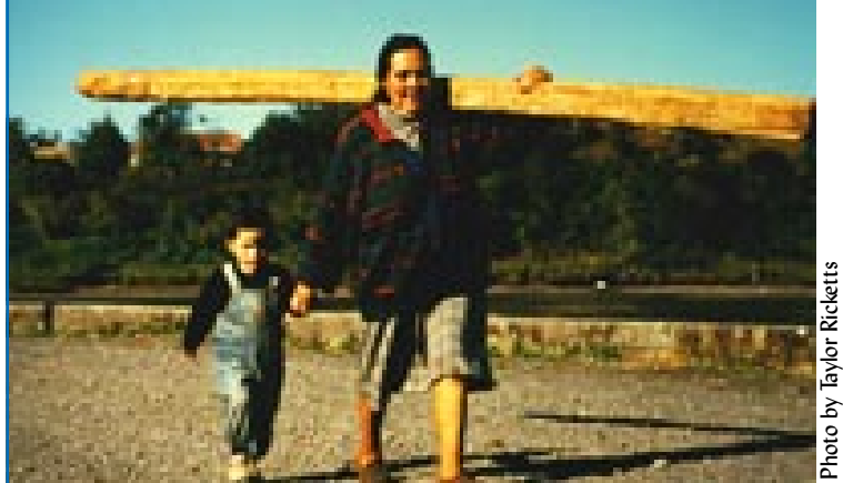
Figure 2 -Woman carrying treetrunk for boatmaking in a fishing village on Chiloe Island, Chile. Natural forests remain an important source of wood for construction, fuel, and other uses.

generating those ecosystem goods that are traded in the marketplace. As a result, this lack of awareness helps drive the conversion of natural ecosystems to human-dominated systems (e.g., wheatlands or oil palm fields), whose economic value can be expressed, at least in part, in standard currency. The second reason to focus on natural ecosystems is that many human-initiated disruptions of these systems -- such as introductions of exotic species, extinctions of native species, and alteration of the gaseous composition of the atmosphere through fossil fuel burning -- are difficult or impossible to reverse on any time scale relevant to society. Third, if awareness is not increased and current trends continue, humanity will dramatically alter Earth's remaining natural ecosystems within a few decades (Daily 1997a, b).