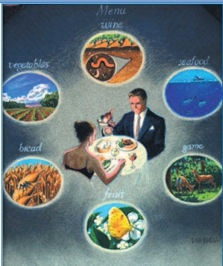
Figure 13 -The production of this meal benefited from many ecosystem services, including natural pest control, pollination, maintenance of soil fertility, purification of water, and moderation of climate.

operation of this model earth, it proved impossible to supply the material and physical needs of the eight Biospherians for the intended 2 years. Many unpleasant and unexpected problems arose, including a drop in atmospheric oxygen concentration to 14% (the level normally found at an elevation of 17,500 feet), high spikes in carbon dioxide concentrations, nitrous oxide concentrations high enough to impair the brain, an extremely high level of extinctions (including 19 of 25 vertebrate species and all pollinators brought into the enclosure, which would have ensured the eventual extinction of most of the plant species as well), overgrowth of aggressive vines and algal mats, and population explosions of crazy ants, cockroaches, and katydids. Even heroic personal efforts