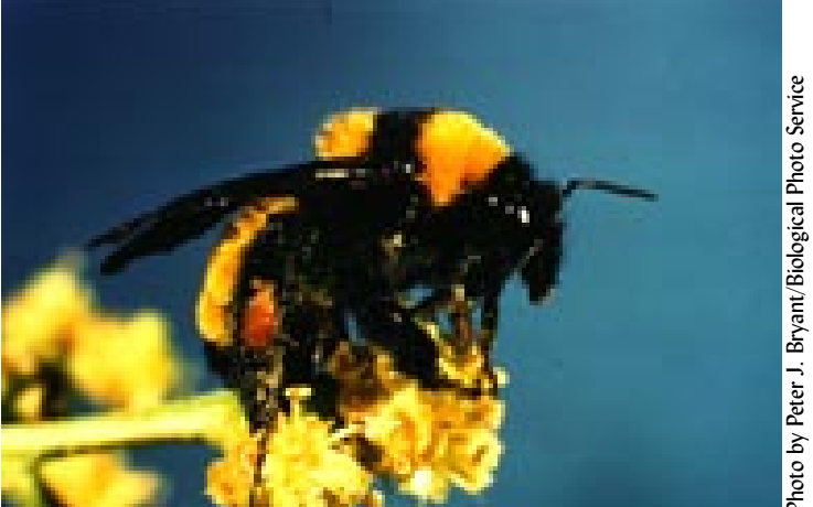
Figure 10-Sonoran bumble bee (Bombus sonorus) pollinating a flower.

Fortunately, an estimated 99 percent of potential crop pests are controlled by natural enemies, including many birds, spiders, parasitic wasps and flies, lady bugs, fungi, viral diseases, and numerous other types of