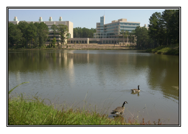
Figure 1 EPA's new "green" research facilities

K_{OL} = overall liquid-phase mass transfer coefficient (m/h),