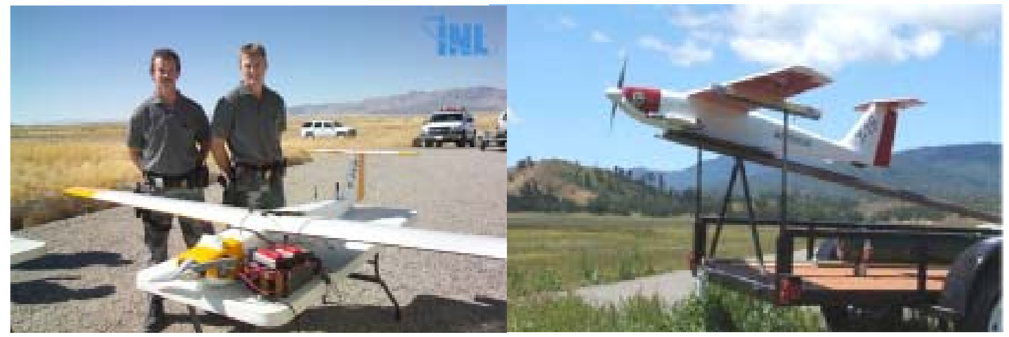
Unmanned aerial vehicles (UAVs) can be flown 24/7 or on demand, and can carry a variety of payloads, including video cameras that can be directed at suspect targets on the ground. Planes can autonomously patrol on a programmed route and remain on site for more than ten hours. They are capable of flying in winds in excess of 30 mph.