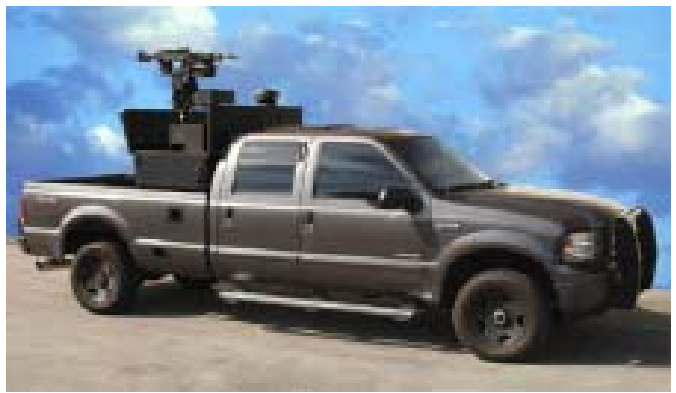
The Advanced Concept Armored Vehicle (ACAV) II with a remotely operated M-240 serves as a force multiplier and enhances survivability.