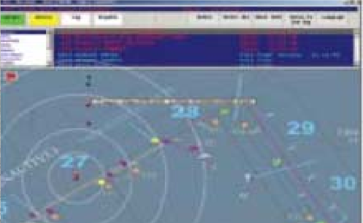
The lightweight PSRS is a millimeter wave radar detection system that scans out to approximately 300 meters and 360 degrees at a speed of up to one rotation per second to provide all-weather perimeter detection.