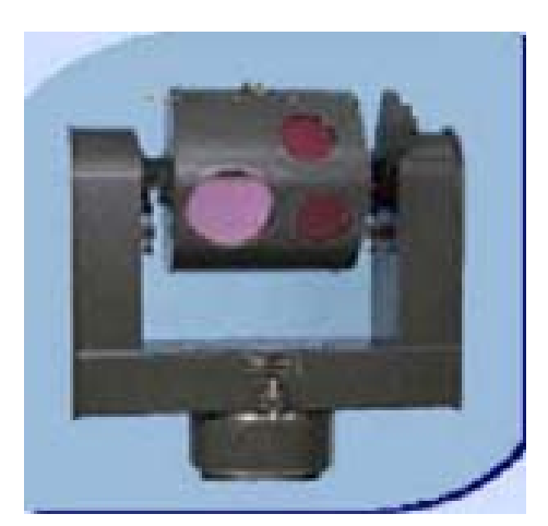
The SPIDER is a motion-stabilized, real-time, automated, electro-optical detection system that rotates to detect multiple targets and then zero in on individual targets.

The process for accomplishing this effort has already begun. A project plan is in the final stages of development, with plans to be on the ground at INL in April for an initial onsite analysis. A multi-