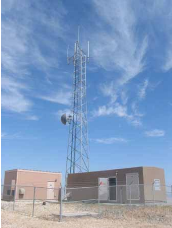
Facility 1 Wyoming 1-Park LTD