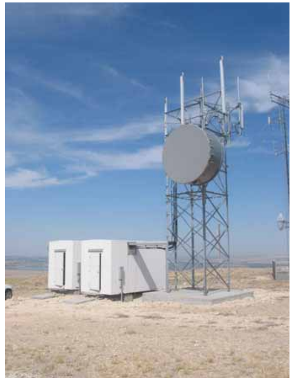
Facility 4 Union Telephone