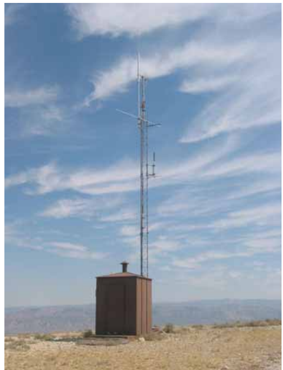
Facility 2 BNSF Railway Company