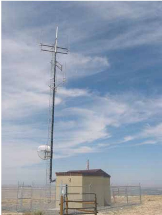
Facility 3 WWC Holding Co., Inc.