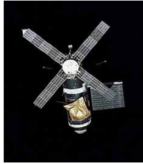
Skylab in orbit with its solar shield in place and solar array fully deployed.

Skylab's final flight path as it disintegrated on reentry.