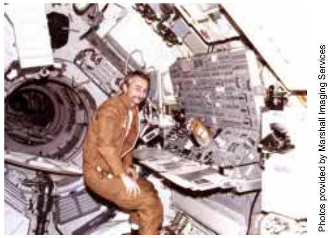
Astronaut Owen Garriott at the control and display planel onboard Skylab's orbital workshop.

Marshall Center celebrates 30th anniversary of Skylab