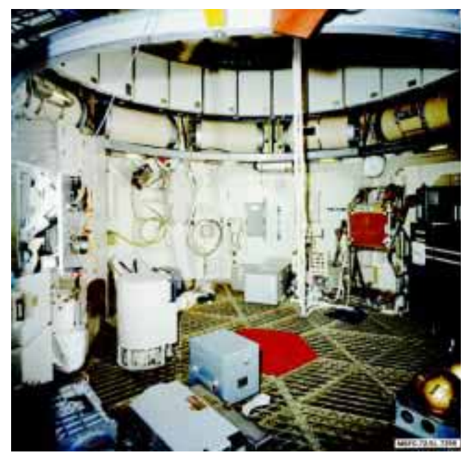
The interior of the Skylab orbital workshop.