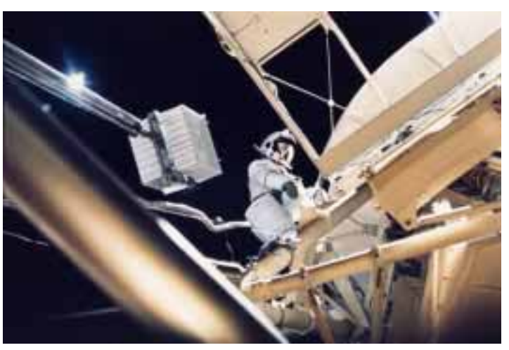
Astronaut Owen Garriott retrieves film during an extra-vehicular activity outside of Skylab on July 28, 1973.

• Joe Kerwin, commenting on the weightlessness of space: "If you go from one module into the other and you're