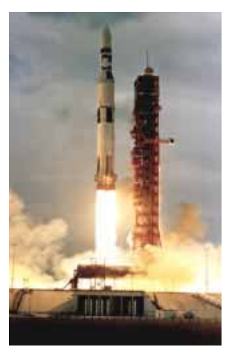
A modified Saturn V lifts Skylab toward the heavens on May 14, 1973.

crew to Skylab on May 15 using a Saturn IB rocket. Faced with the crisis of how to fix the station so that it would be habitable, NASA put the crew launch on hold. It was May 25 when Skylab's first crew went into space and conducted repairs to the station. They returned home on June 22.