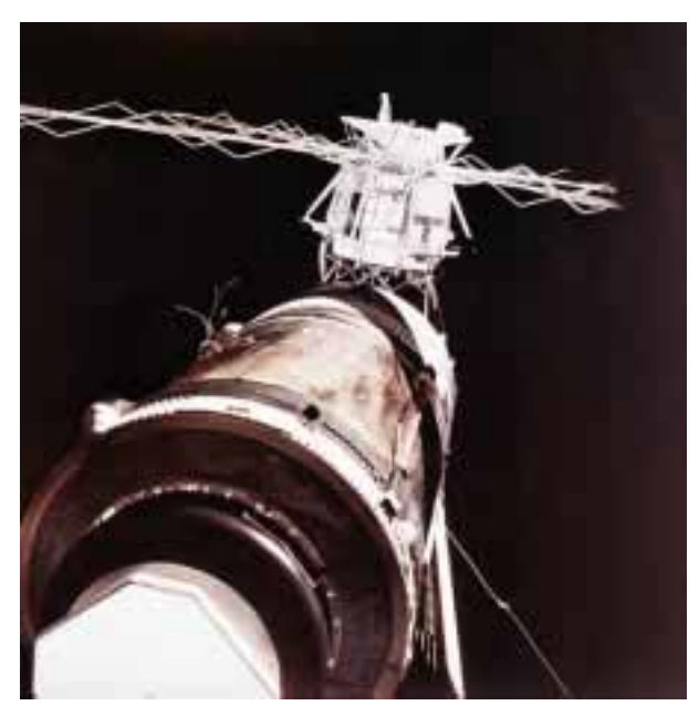
A crippled Skylab in orbit with its heat shield gone, one solar wing gone, and the other solar wing not deployed.

The solar arrays were designed to provide electrical power to the orbital workshop. The solar arrays for the Apollo