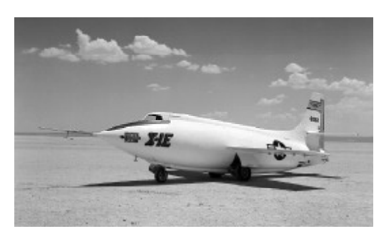
X-1E on lakebed.

The no. 2 X-1 was modified and redesignated the X-1E. The modifications included adding a conventional canopy, an ejection seat, a low-pressure fuel system of increased capacity, and a thinner high-speed wing.