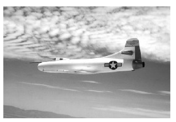
D-558-1 in flight. NASA photo E-713.

A single-place, straight-wing, jet-powered aircraft, the D-558-1 "Skystreak" was manufactured by Douglas Aircraft Company for a joint Navy/NACA flight research program. It was designed to investigate jet-aircraft characteristics at transonic speeds, including stability and control and buffet investigations.