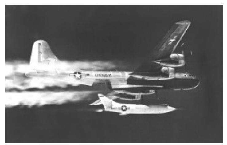
D-558-2 in flight. NASA photo E-713.

was to investigate the flight characteristics of a swept-wing aircraft at high supersonic speeds. Particular attention was given to the problem of "pitch-up," a phenomenon often encountered with swept-wing configured aircraft. The D-558-2 was a single-place, 35-degree swept-wing aircraft measuring 42 feet in length. It was 12 feet, 8 inches