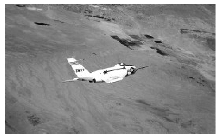
X-4 in flight.. NASA photo E-713.

The X-4, a single-place, swept-wing, semi-tailless aircraft was designed and built by the Northrop Aircraft Compnay for NACA. It had no horizontal tail surfaces and its mission was to obtain in-flight data on the stability and control of semi-tailless aircraft at high subsonic speeds. The two X-4 aircraft were 23 feet long, 14 feet high, and had wingspans