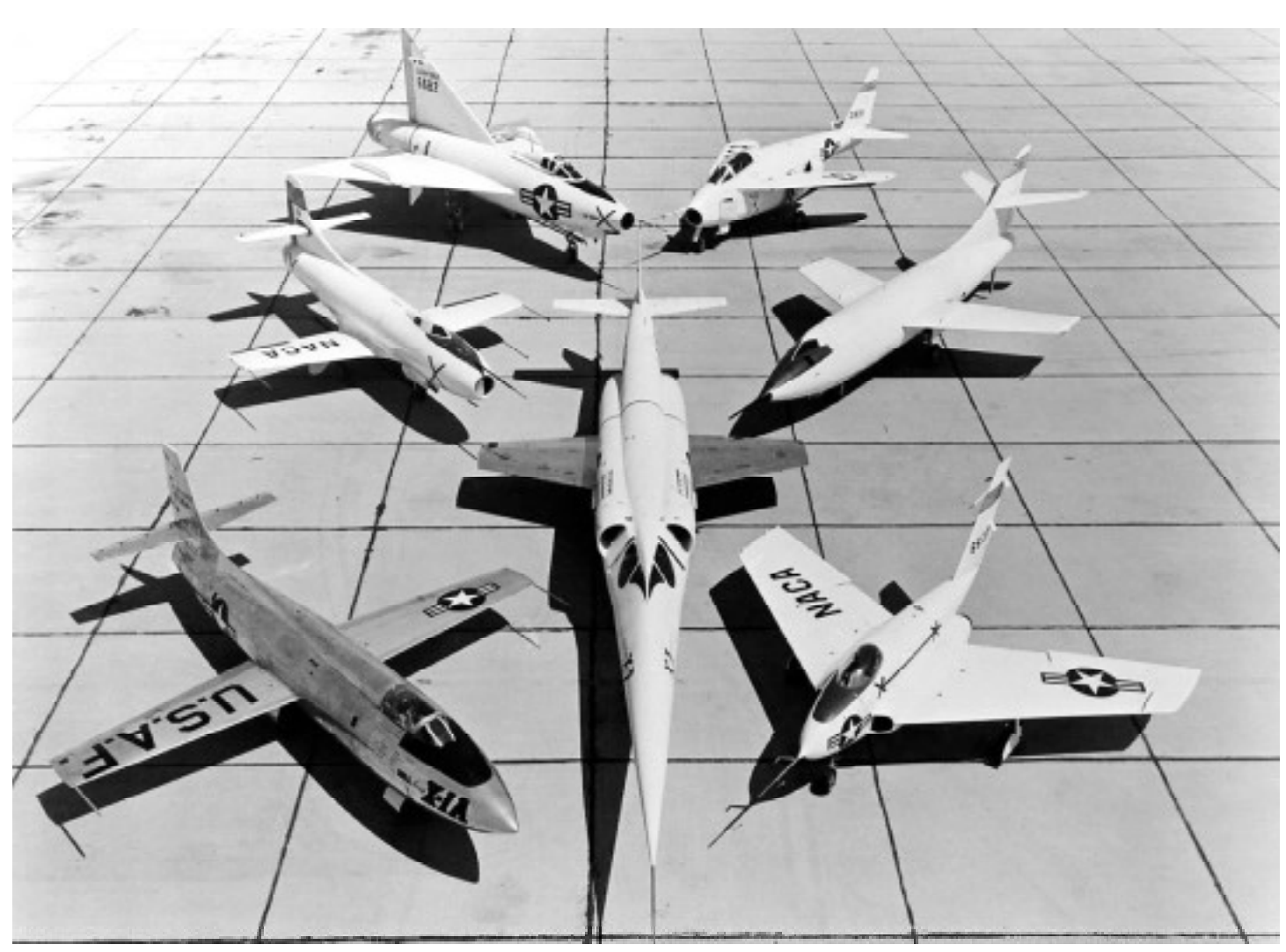
X-3 (center) and, clockwise from left: X-1A, D-558-1, XF-92A, X-5, D-558-2, and X-4.

The Research Airplane Program was a joint research effort by the National Aeronautics and Space Administration (NASA--formerly the National Advisory Committee for Aeronautics or NACA) and the military services. It was conceived near the end of World War II to perform flight studies with a series of specially-constructed research aircraft in the then-unexplored transonic to low-supersonic characteristics of full-scale aircraft in flight.