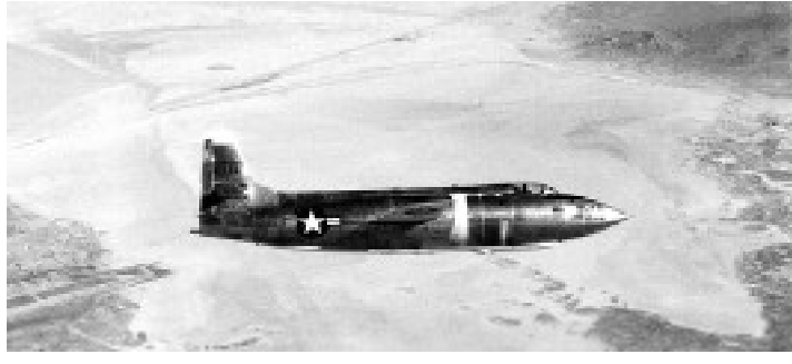
X-1A in flight over lakebed. NASA photo E-2490.

Their mission was to continue the X-1 studies at higher speeds and altitudes. The X-1A began this research after the X-1D was destroyed in an explosion on a captive flight