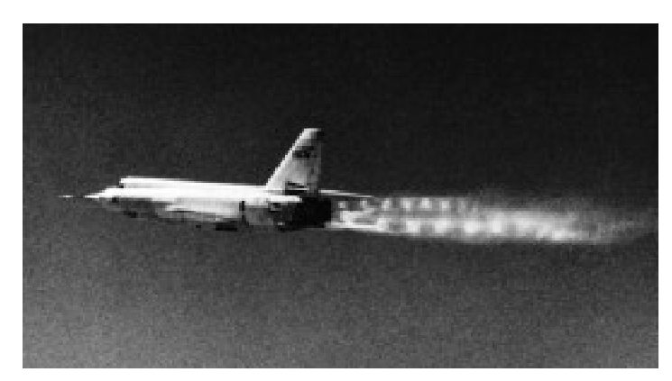
X-2 in flight.

The X-2 was a single-place airplane with wings swept back 40 degrees. It was 37 feet, 10 inches long (fuselage only); 11 feet, 9 inches high; and had a wingspan of 32 feet, 3