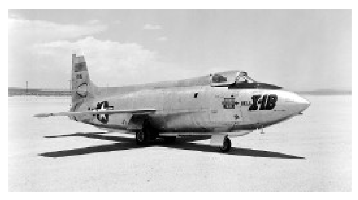
X-1B on lakebed.

The X-1B was fitted with 300 thermocouples for exploratory aerodynamic heating tests. It also was the first aircraft to fly with a reaction control system, a prototype of the system used on the X-15. The X-1C was cancelled before production.