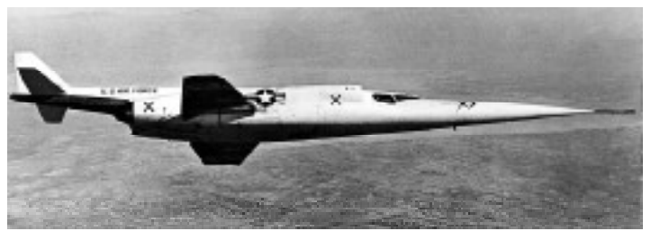
X-3 in flight NASA photo E-17348.

gate the design features of an aircraft suitable for sustained supersonic speeds.