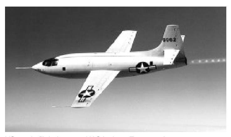
XS-1-1 in flight in 1947. NASA photo E60-6204A.

e that was built by the Bell Aircraft Company for the U S. Air Force and the NACA. The mission of the X-1 was t