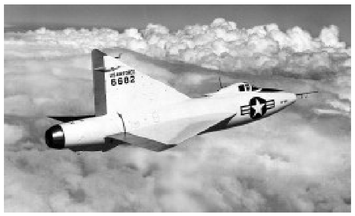
XF-92A in flight.

The XF-92A was this country's first delta-wing aircraft. It was flown to obtain data on the flight characteristics of a delta-wing aircraft in the transonic speed range.