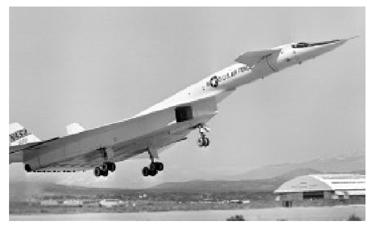
XB-70A taking off.

The XB-70 was the world's largest experimental aircraft. It was capable of flight at speeds of three times the speed of sound (roughly 2,000 mph) at altitudes of 70,000 feet. It was used to collect in-flight information for use in the design of future supersonic aircraft, military and civilian.