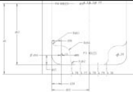
FIGURE 3. Symbolic Dimensions

This orthographic view of the housing part is augmented with annotations representing some of the dimensions established in the development of the part design. Once symbolic dimensions are identified, the designer can replace implied values with specific values or equations.