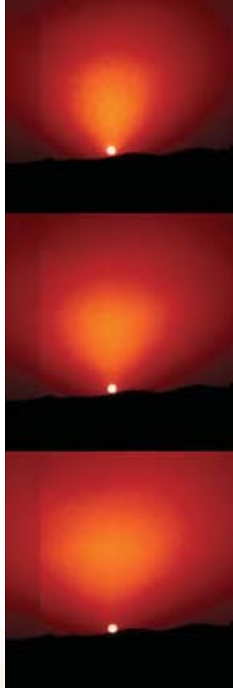
Because dust extends high into the atmosphere, the Martian sky stays bright for up to two hours after sunset.

Why did the individuals of one team work so well with another, while the other teams suffered from numerous conflicts and communication gaps? Tied into this are a number of factors. One of the things that