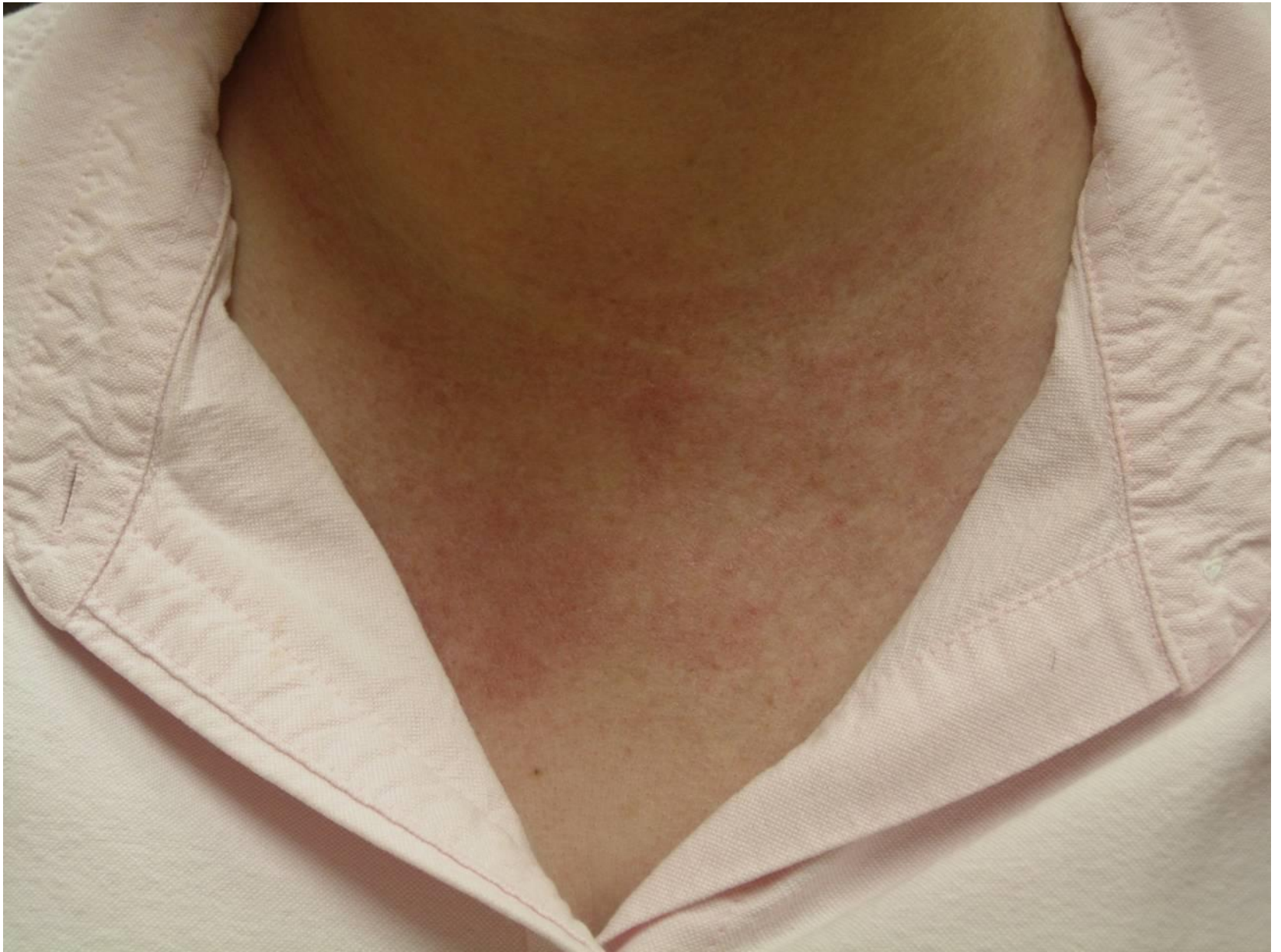
4S. V neck. Confluent erythema around the anterior base of the neck and the upper chest, often in the shape of a “V”