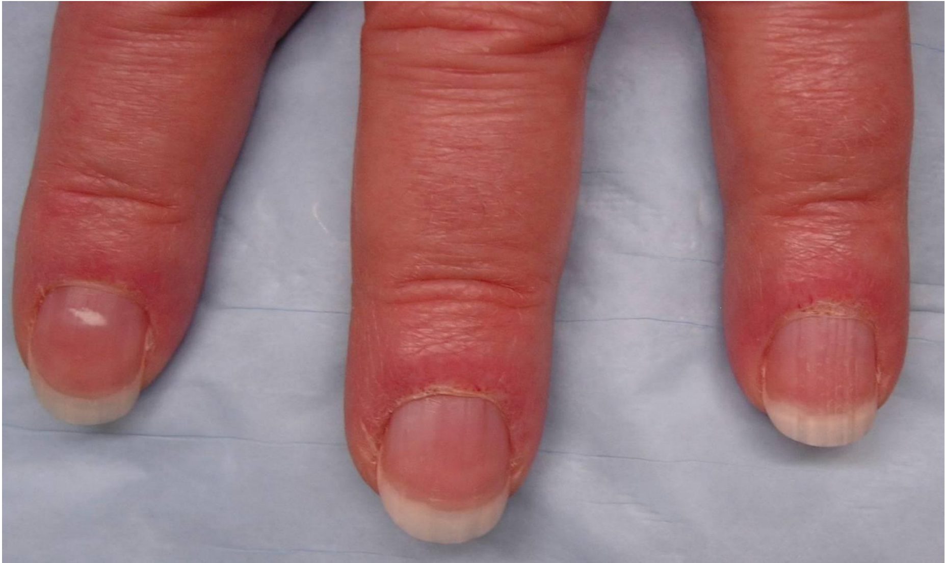
13S. Cuticular dystrophy. Enlargement or overgrowth of the cuticle onto the nailbed