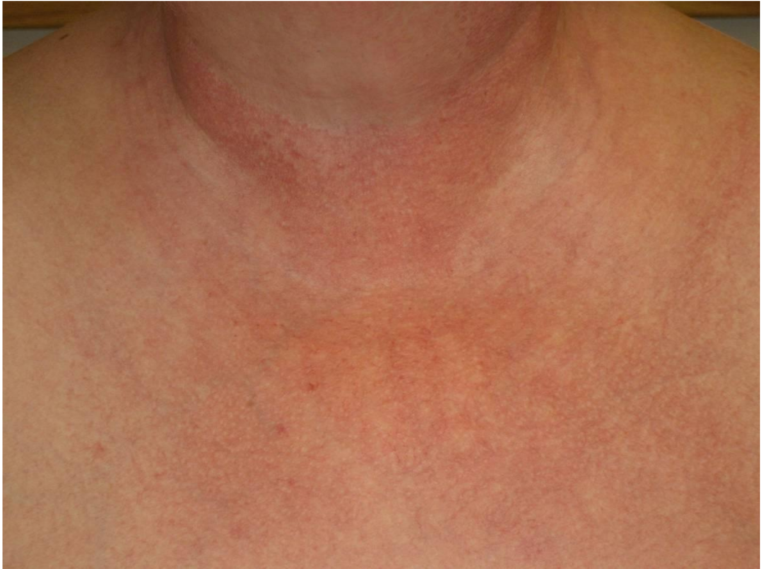
14S. Poikiloderma- A fine speckled pattern of hyperpigmented and hypopigmented macules interspersed with fine telangiectasia and cutaneous atrophy