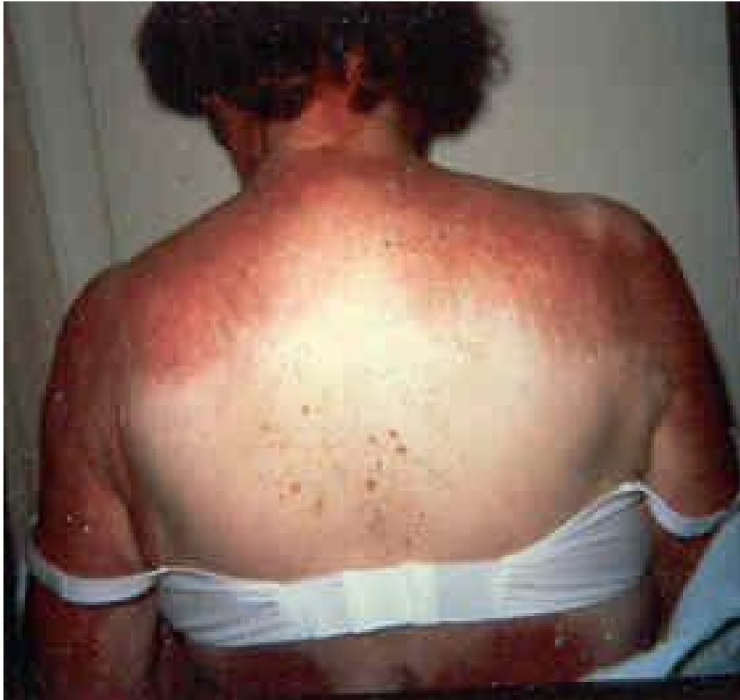
5S. Shawl sign Confluent erythema around the posterior base of the neck, back and upper shoulders, often in the distribution of a shawl