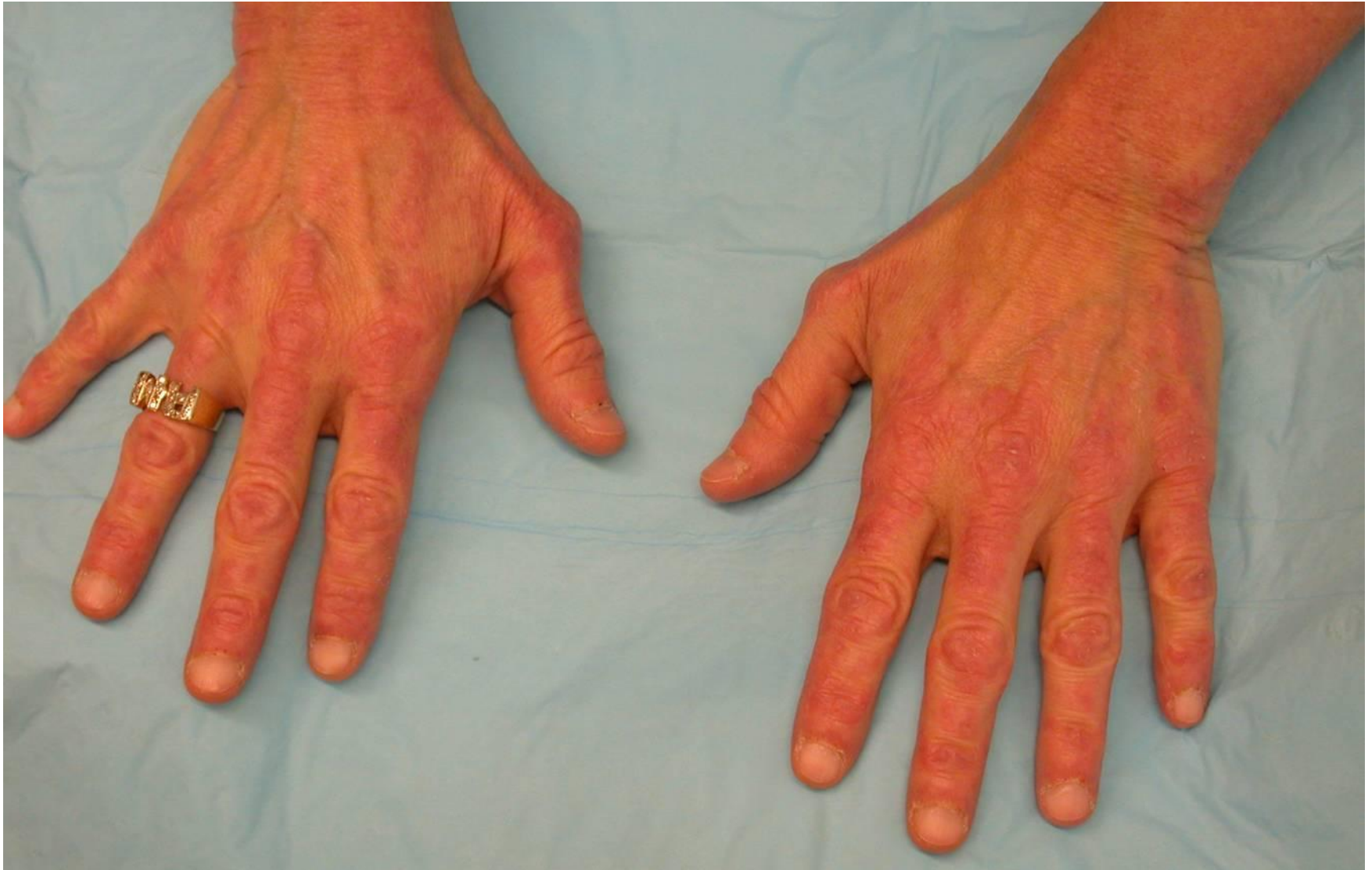
7S. Linear extensor erythema- Erythema specifically located over the extensor tendon sheaths of the hands, forearms, feet and/or forelegs