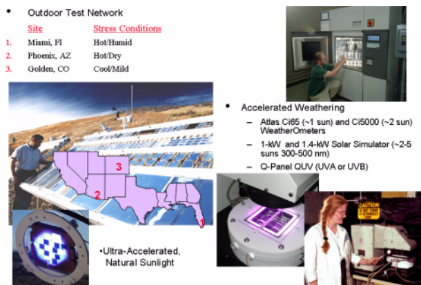
Figure 1. Durability Test Options Available to the Task

contacts with a number of suppliers of polymers to markets that require outdoor service. This provides access to samples for testing.