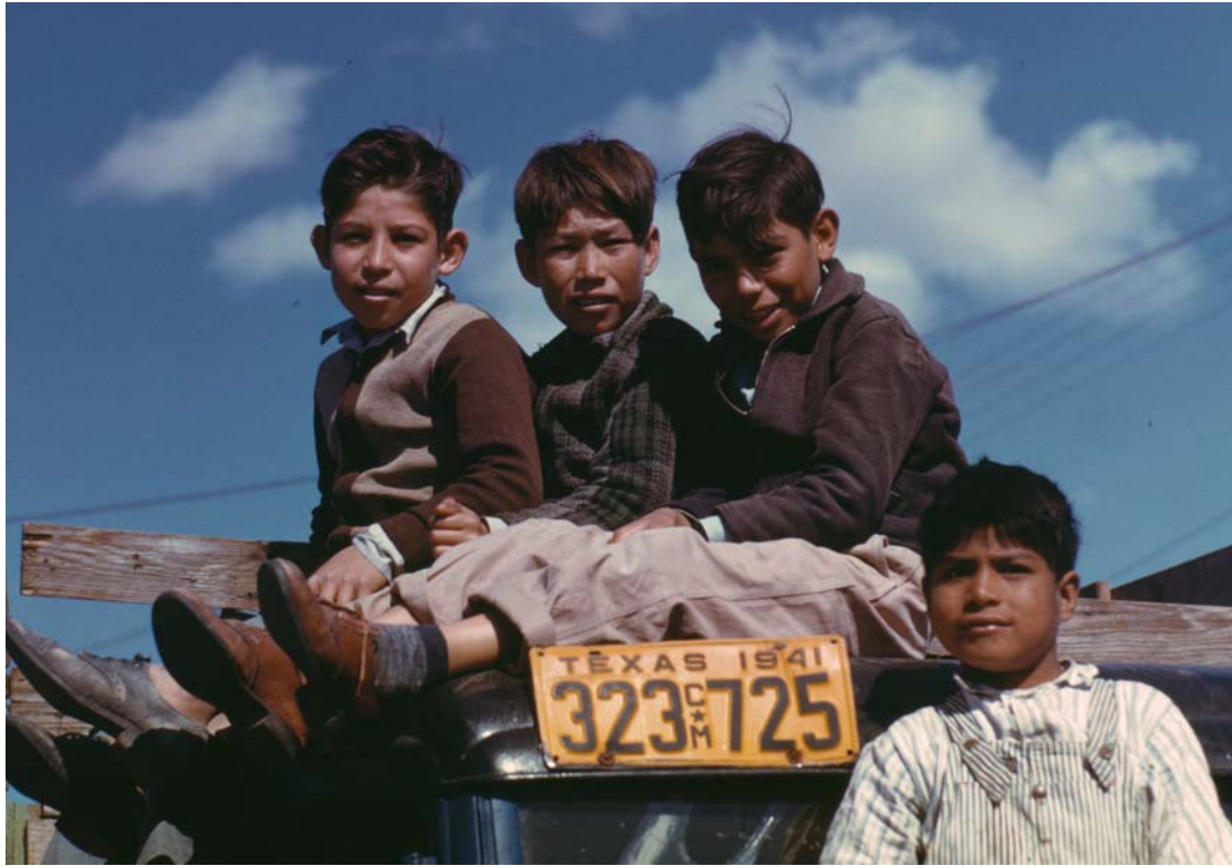
Boys sitting on truck parked at the FSA ... labor camp, Robston, Tex. 1942 http://hdl.loc.gov/loc.pnp/fsac.1a34264

On the fourteenth day of April of nineteen thirty five, There struck the worst of dust storms that ever filled the sky: You could see that dust storm coming, the cloud looked deathlike black, And through our mighty nation, it left a dreadful track... This storm took place at sundown and lasted through the night, When we looked out this morning we saw a terrible sight: We saw outside our windows where wheat fields they had grown Was now a rippling ocean of dust the wind had blown. It covered up our fences, it covered up our barns, It covered up our tractors in this wild and windy storm. We loaded our jalopies and piled our families in, We rattled down the highway to never come back again. (Woody Guthrie, from "Dust Storm Disaster")