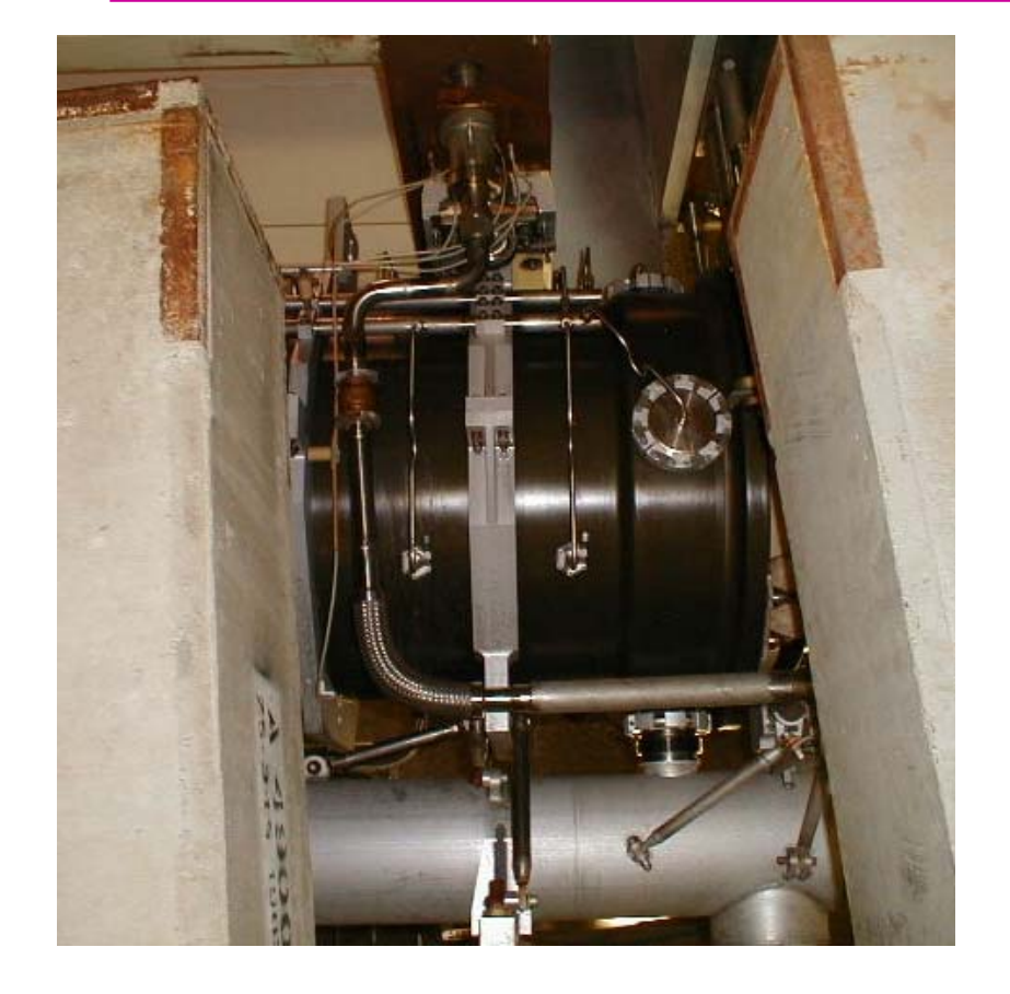
Set up temporary shielding with slot

NuMI Horn 2 repair update Jim Hylen - FNAL All Exp. Mtg. May 1, 2006 Page 5