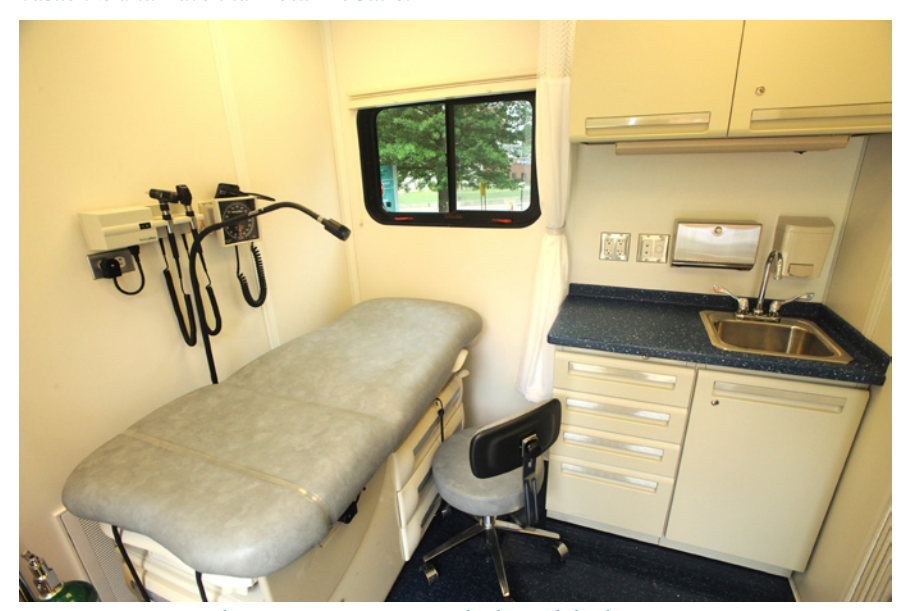
An interior view of the patient care area inside the mobile clinic