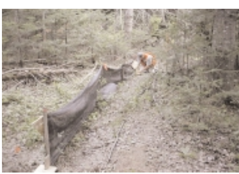
Wildlife surveys. This drift fence leading to a pitfall trap at Harper's Meadow helps refuge interns survey amphibian populations.

15. How do you feel about the U.S. Fish and Wildlife Service acquiring land from willing sellers in the Umbagog Lake area?