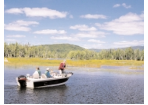
Fishing on Leonard Pond .

9. Are any of these activities, or current levels of use in general, a concern?