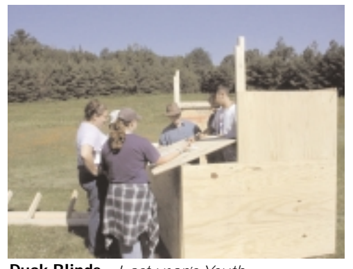
Duck Blinds. Last year's Youth Conservation Corps (YCC) constructed six observation blinds for the refuge.

5. Have you participated in any refuge-sponsored events or activities? If so, which ones?