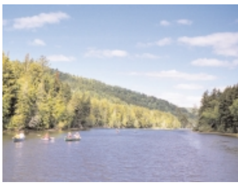
Paddlers on the Magalloway River.

3. What do you value most about the upper Androscoggin River watershed (including Umbagog Lake)?