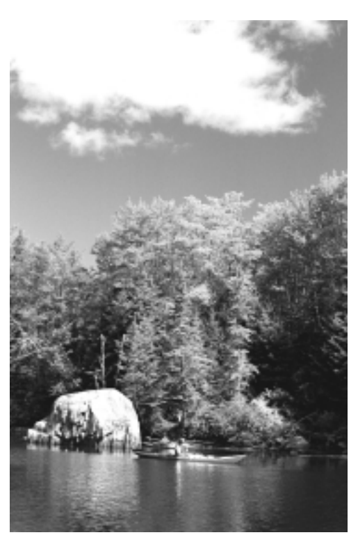
Kayakers at Pulpit Rock.