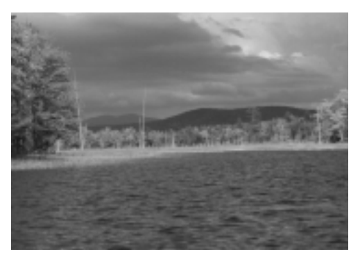
A view across the lake.

8. Where did you obtain this workbook? (This will help us determine the most effective places to distribute these in the future.)