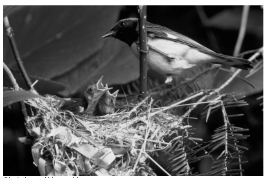
Black-throated blue warbler.